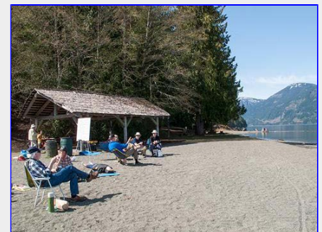
Lunch on the Comox Lake beach on Day 2