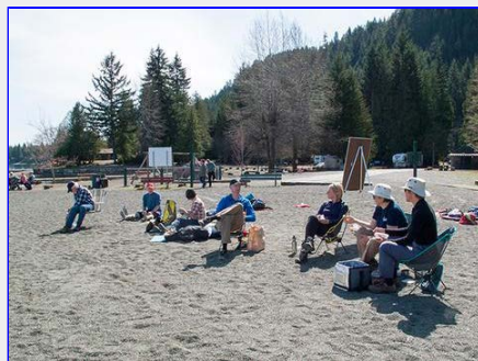
Lunch on the Comox Lake beach on Day 2