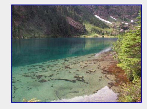
The Lake