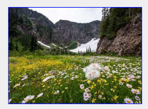
Beyond the lunch rock the valley was covered in wild flowers