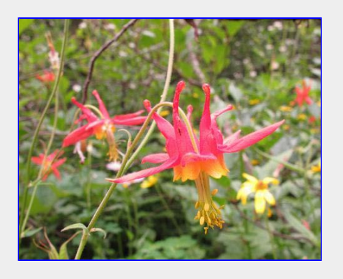
Sitka Columbine