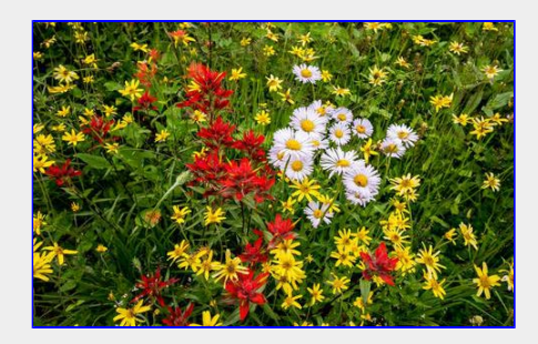
Dull day, but plenty of colour in the flowers