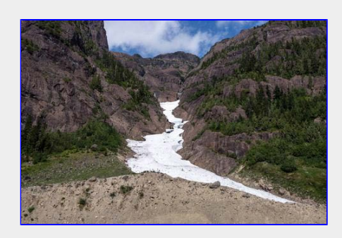
Gully to the north above Comox Creek

The mystery 'seedy plant' looks like sweet coltsfoot (Petasites frigidus). Seeing the leaves would confirm. (Krista)