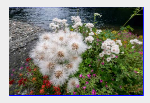
Can anyone name this seedy plant?