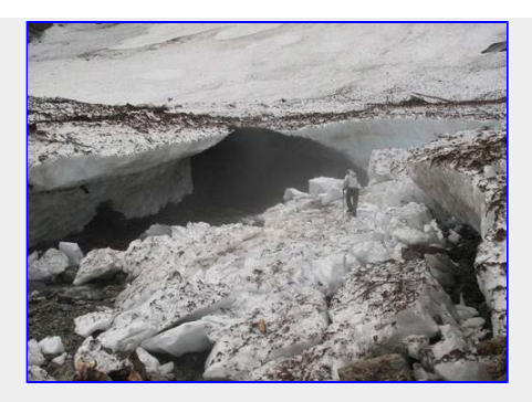
Linda on approach to main cave