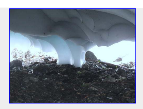
Supporting Ice columns