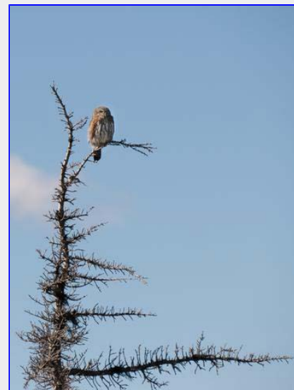
A Northern Pygmy Owl keeping an eye on us as we packed up camp

Report contributors: Carol H, Glenn O, Al T,