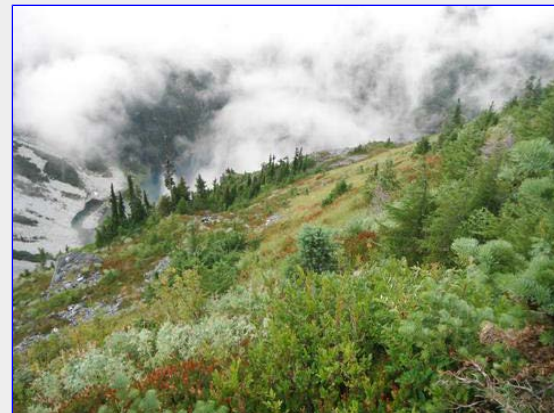
View from camp to Mirren Lake