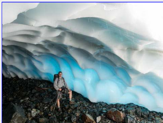
One of the snow caves by Mirren Lake