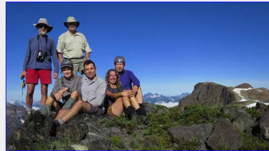
Group shot, Iceberg Peak, with Mt Celeste to the right