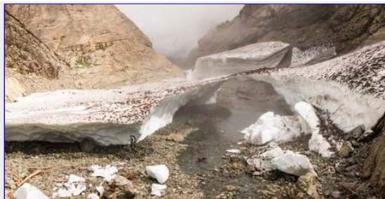
Snow Bridge