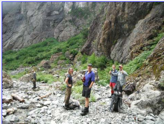
Happy hikers on the way in