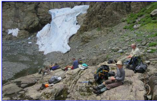
Lunch stop on the way up

https://plus.google.com/photos/111843407128389137437/albums/6049138306303614369