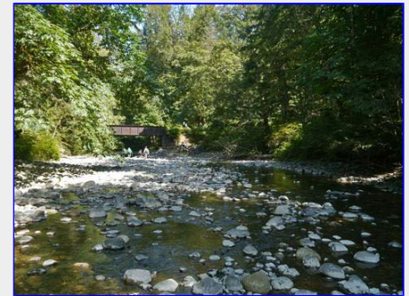
Walking on the riverbed