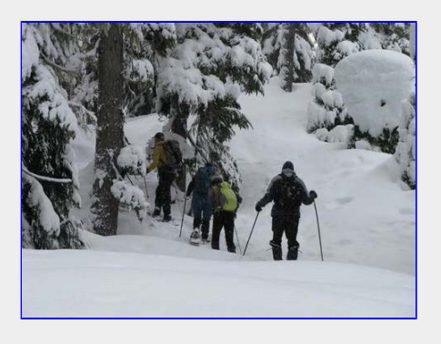
Snowing on the trail

Lovely Wednesday shoe across Battleship Ridge onto Battleship Lake and out to the island at the north end of the lake for our turn around. Nice group of participants including a couple of folks checking us out. Pictures depict our snowy day with some flurries and lots of new stuff on the ground - Thanks to Don for capturing the essence of our day and for Pam getting them to the report on time! The 3 hr trek was finished off with lunch in the Raven Lodge along with hot brews - Hoping all enjoyed as much as I did and a swell way to welcome in the Holiday Season. Merry Xmas.