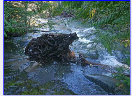
'Uprooted' at Sykes Bridge