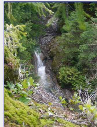
Perseverance Creek Falls