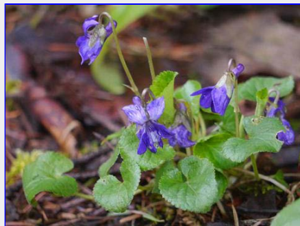
Early Blue Violets (Viola adunca)

A nice hike through the hills near Cumberland. We traveled 10km, most of which was either going up or down, and finished 4 hours after we started. At the start a large group of grade 8 students were heading in the same direction so we made a quick detour to another trail! The weather was very pleasant and so was the company.