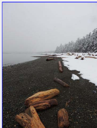
Winter Shoreline