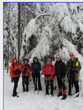
A Happy Bunch!