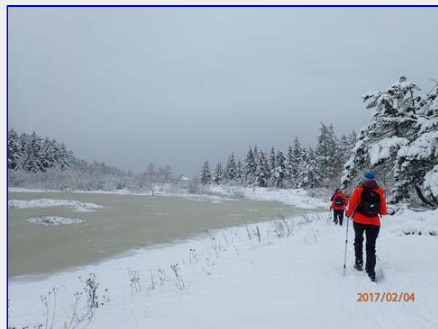
Ah, I see the pub in the distance.