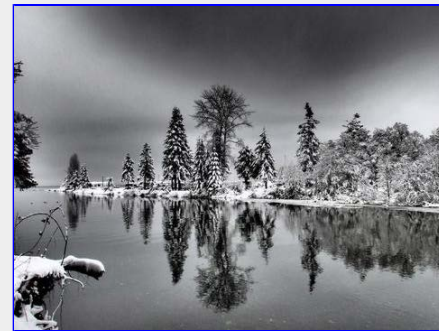
A perfect shot!