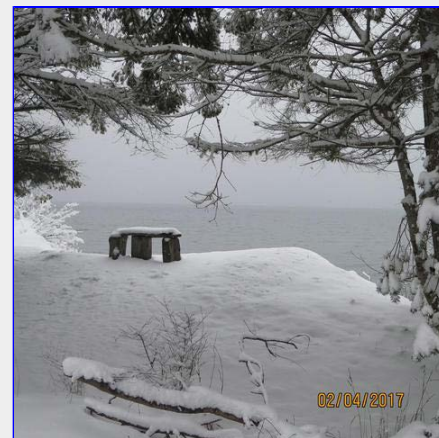
a resting spot