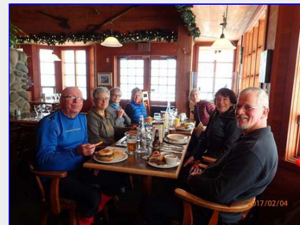
Good food!