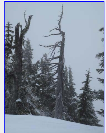
Old Snag