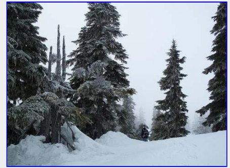
And over the hills we go. The fog formed hoar frost on the trees and snags