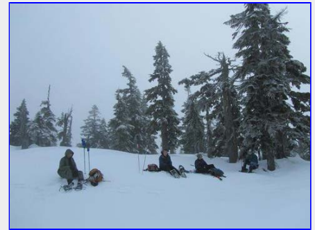
lunch before the overlook which we did not go to due to fog