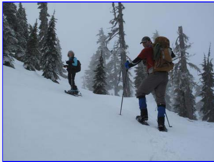
Nearing the Summit