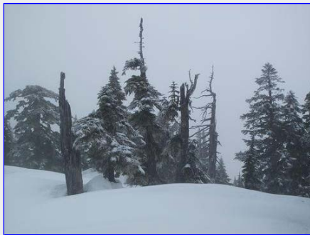
The view from the summit