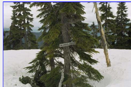
The "summit" of Mt. Ginger Goodwin.