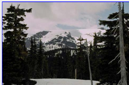
Comox Glacier from Mt. Ginger Goodwin.

We all met at the Court House and left at 8 am. After getting thru the guard along Comox Lake, we were off to the trail head. We were a group of 13 most of the way up, with the other group going all the way to the end of Lee Plateau. Near the junction of the split in the trail (Capes Lk to Left, Idiens Lk. to Right) the group separated in two. We had snow all the way to the summit of Mt. Ginger Goodwin. We enjoyed lunch and took in the view. A great spot to see the Comox Glacier and Idiens lake. It took about 3 and half hours to reach the summit. A climb of 1,000 meters in about 4.5 kms of steep trail. Coming back down, we were in contact with the other group. We were just ready to leave at the bottom, back at the trucks when the other group was coming back.