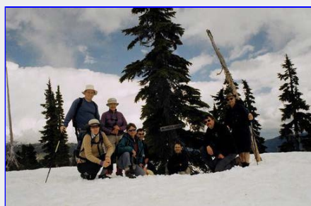
A group picture at the "summit".