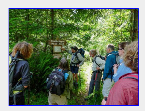
Our leader describing the route we will take