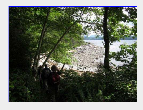
Along the coast