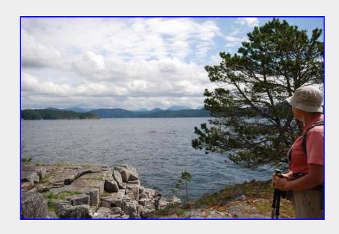
stopping to watch some kayakers and a coast guard vessel