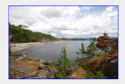
great views