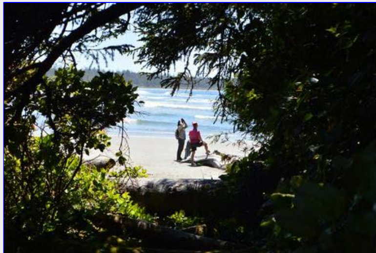
Saturday Exploring