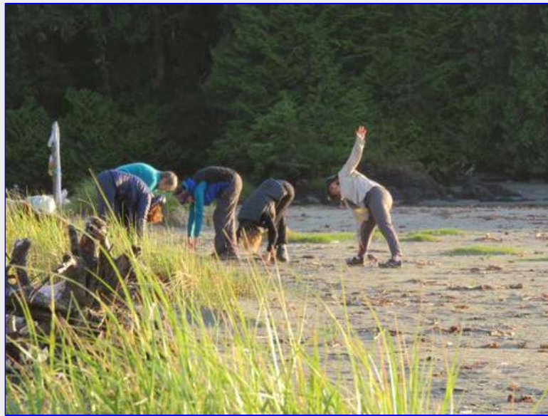
Small group activity