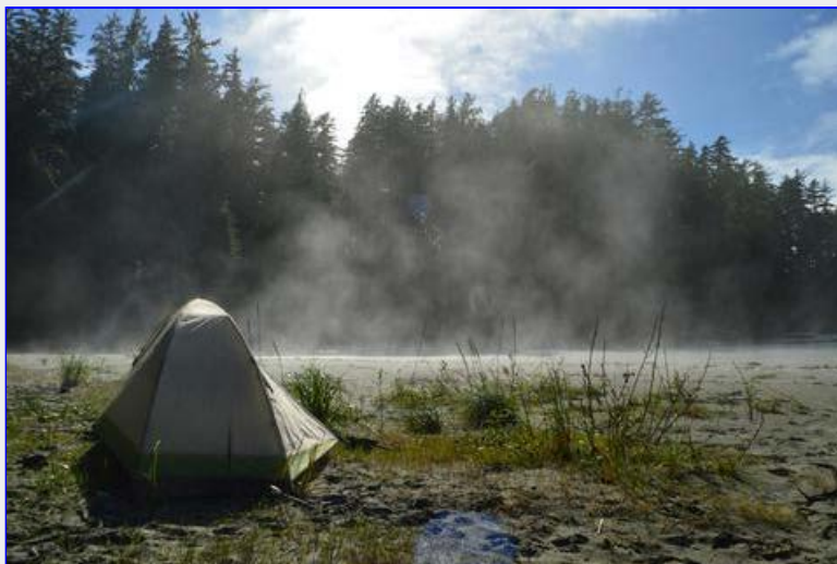
Steam from the sun....time to dry out