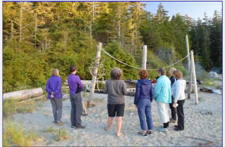
Saturday night group activity