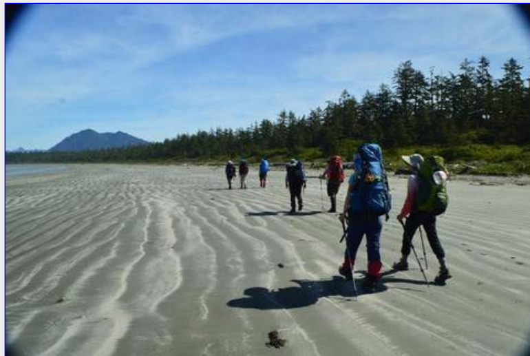
Heading out