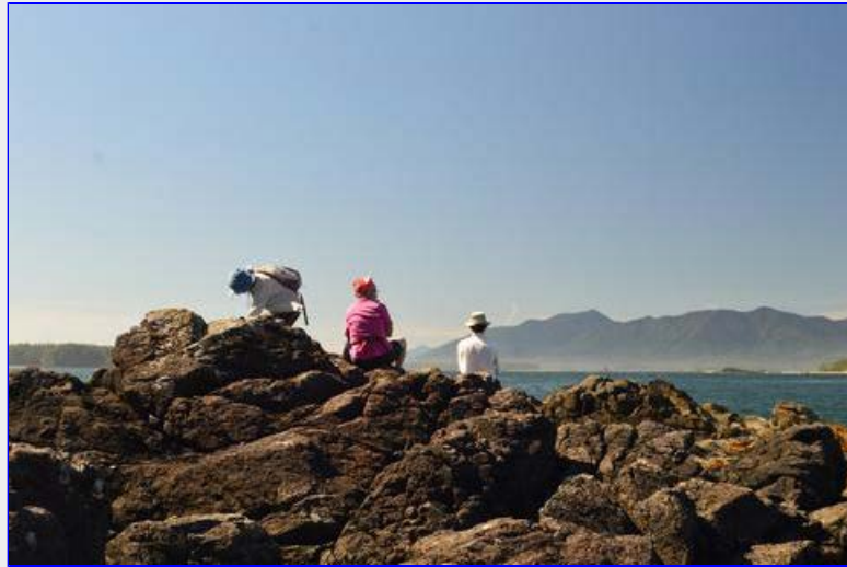
Saturday Exploring