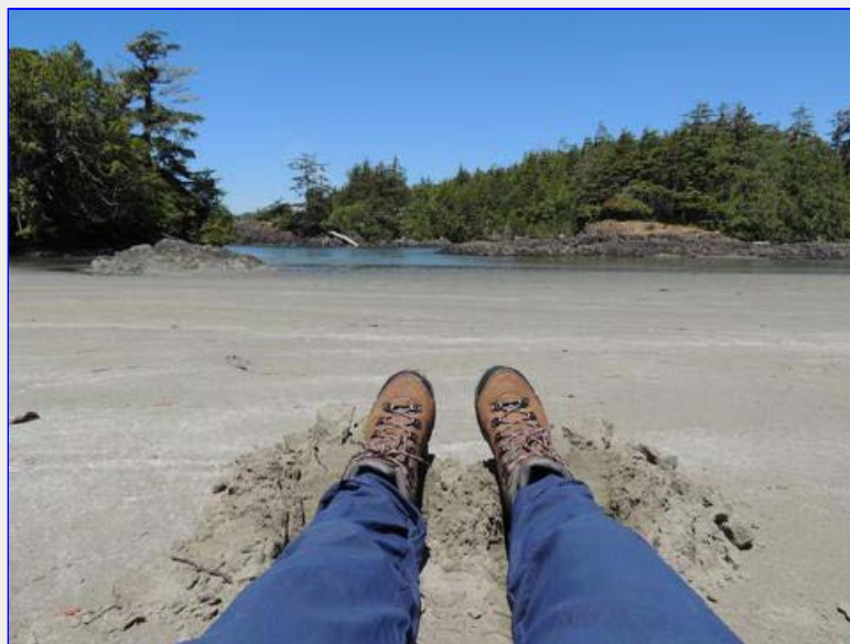
Lazy boots