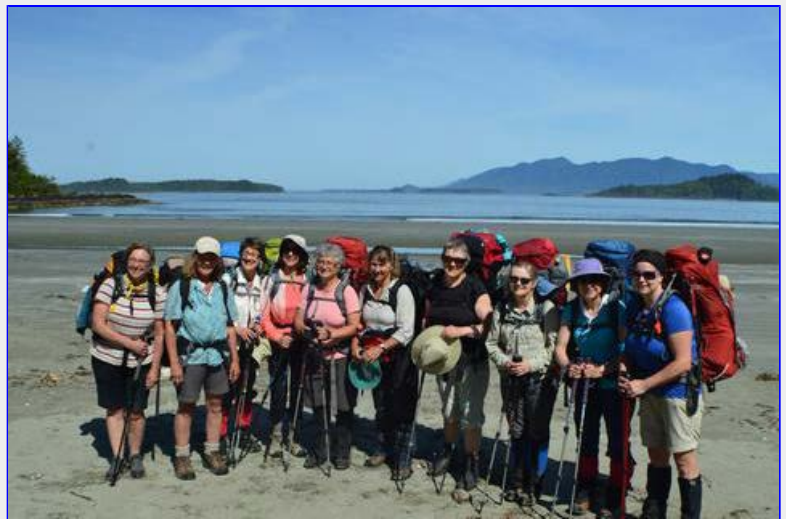
Vargas Island 2016 Group Photo