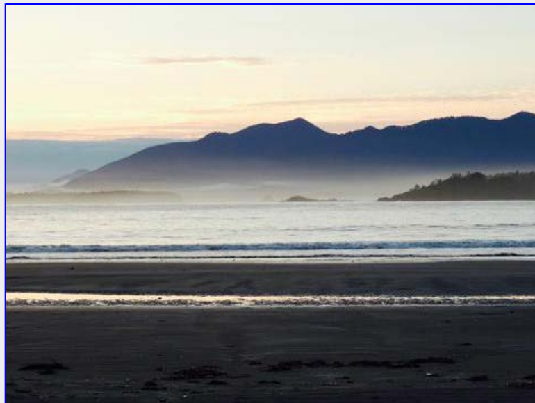
Nature's soft palette