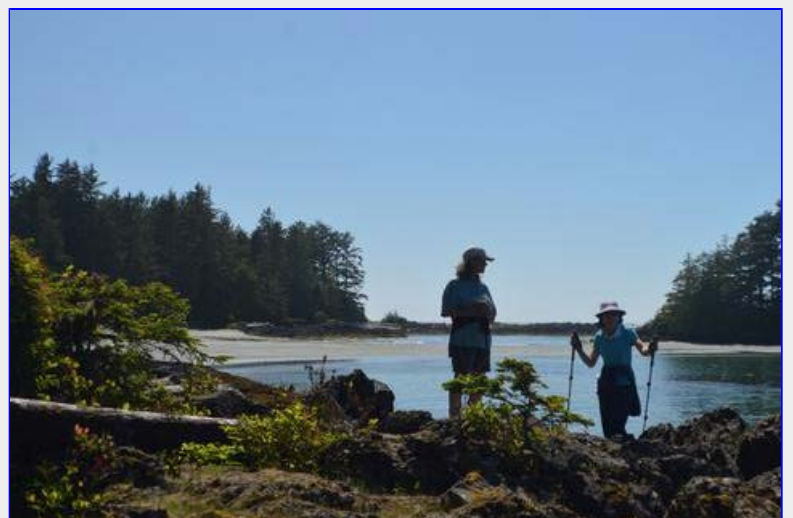
Saturday Exploring