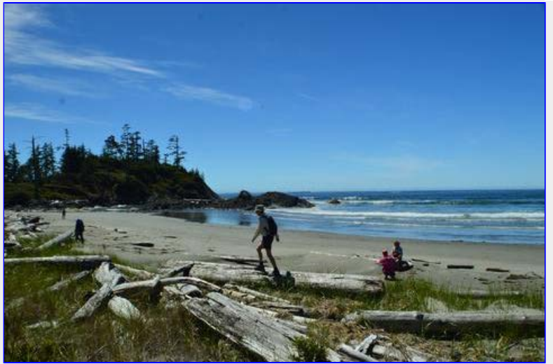
Saturday Exploring