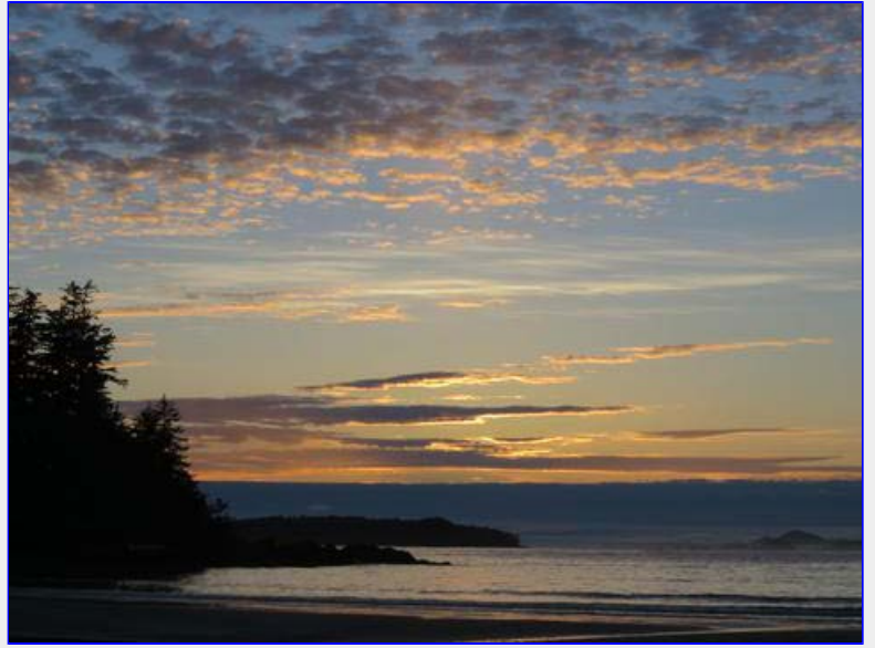
Friday Night Sunset