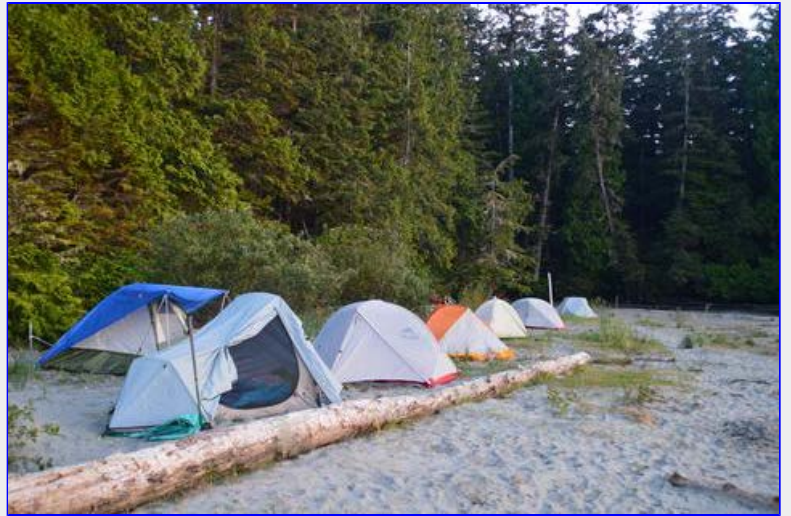
Tent City