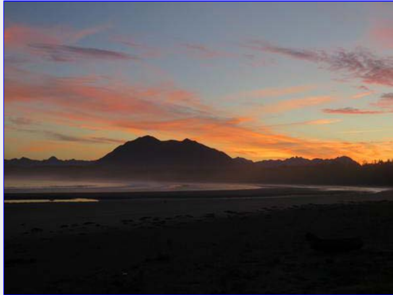
Saturday Sunrise