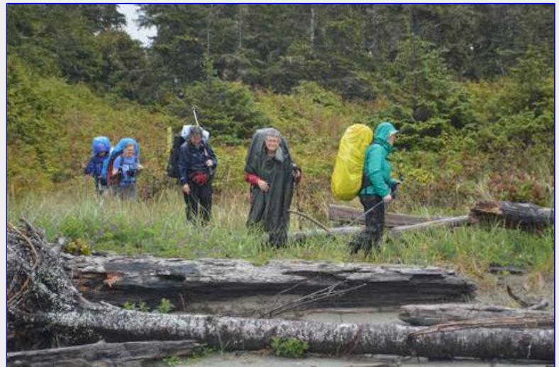
Finally on the beach