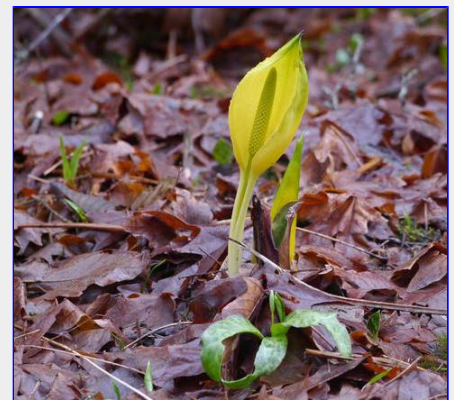
Swamp Lantern & Fawn Lily leaves in Masters Greenway