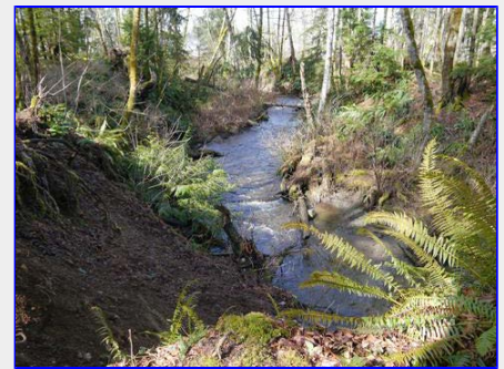
Morrison Creek overlook