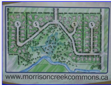
Map of Morrison Commons: nature trail between houses & Morrison Creek wetlands (properties on left half are not yet developed)