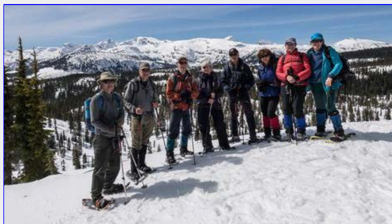
Lunchtime viewpoint group shot