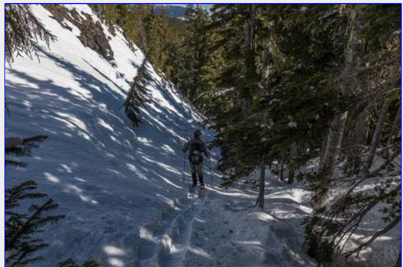
Down the steep gully