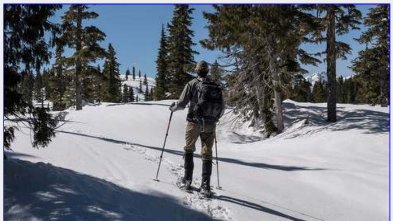
Approaching Croteau Lake