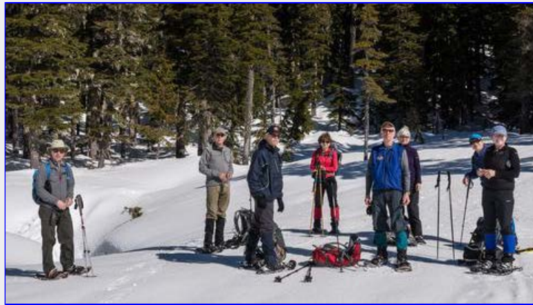
At the north end of Lady Lake