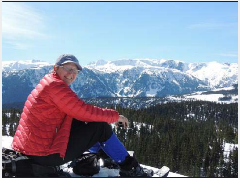
Lunch stop