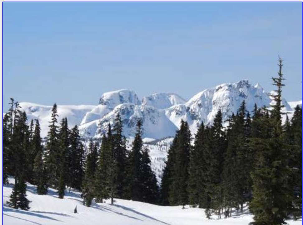
Stellar views