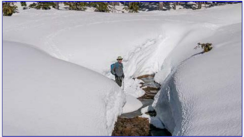
Deep snow at the north end of Lady Lake