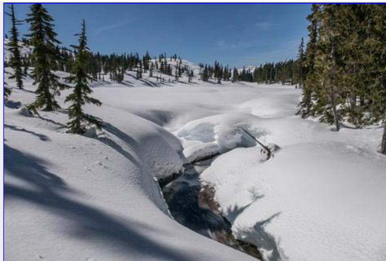
Outflow from Croteau Lake