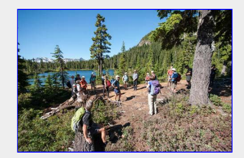
Gathering at the lake before hiking up to the ridge [Carol Hunter photo]

with a lifetime membership [Carol Hunter photo]