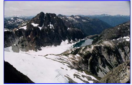
Milla Lake 1/2 frozen with Mt Harmston in the background