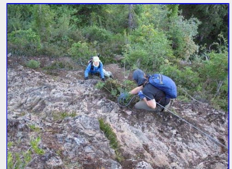
Working the ropes