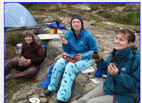
Wine & chocolates for everyone