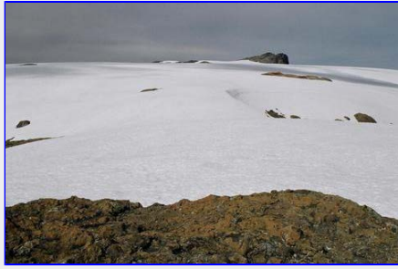
Looking from south summit to north summit