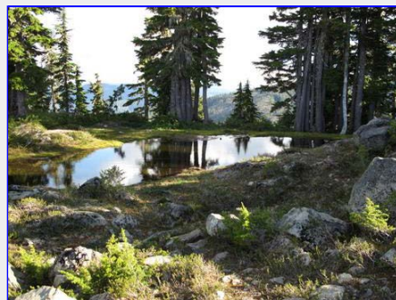
Tarn on the ridge