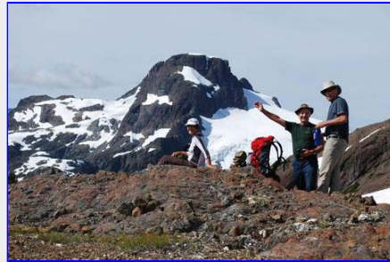
Red Pillar Mtn