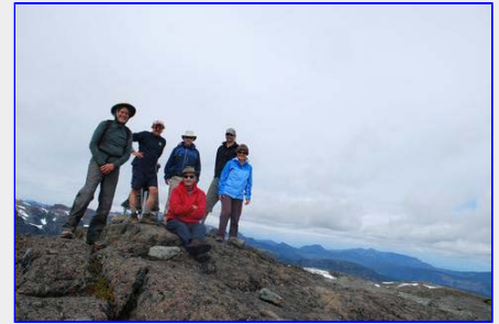
Group summit shot