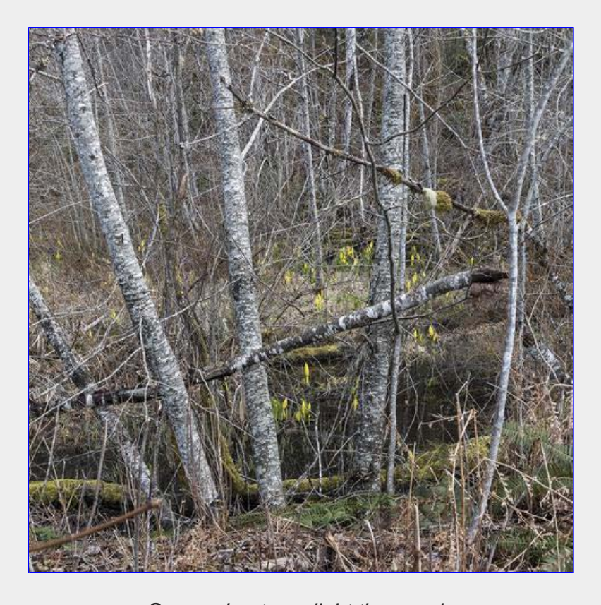
Swamp Lanterns light the woods