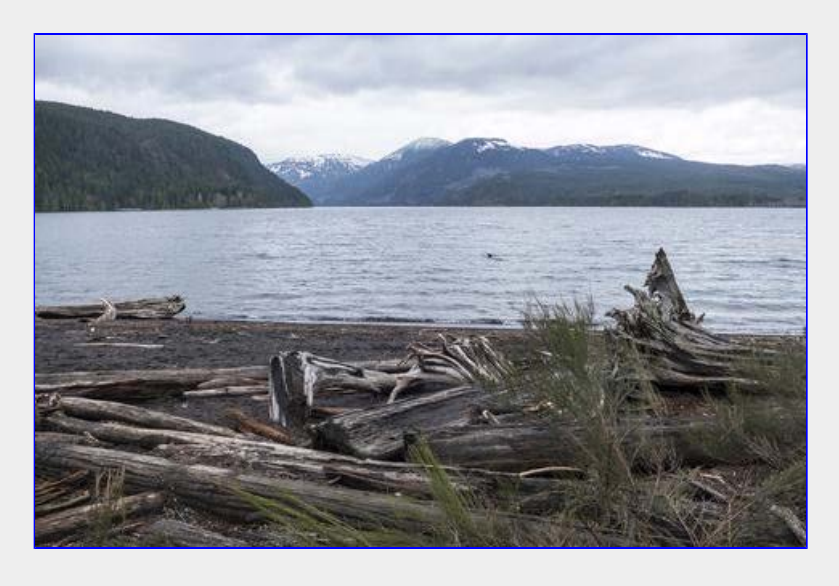
Our destination: lunch at Comox Lake