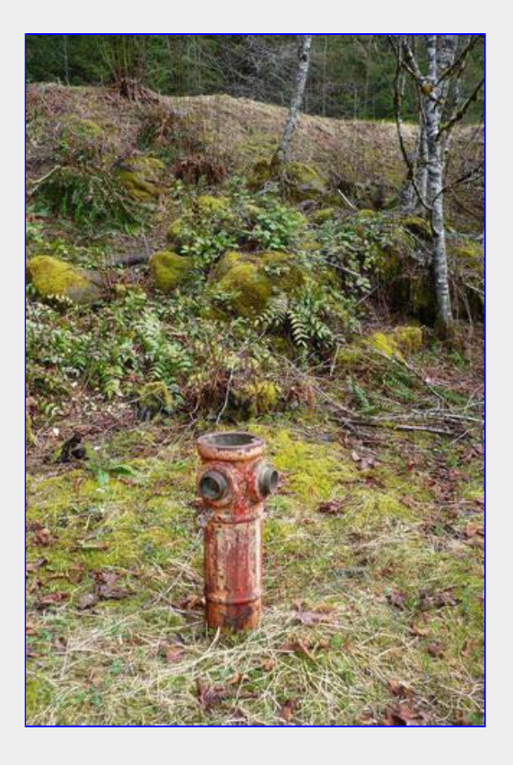
Fire safety from days gone by.