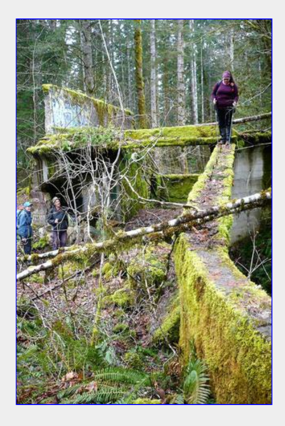
Former competitive log roller, Juanita, can scale just about anything!