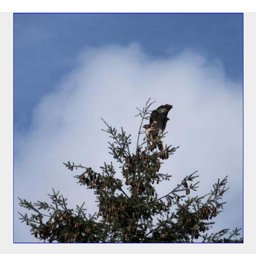
A ruffled Red-tailed Hawk being pestered by a Common Raven