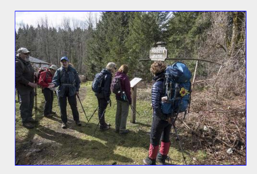
Sunshine at the start: Porkey's Path