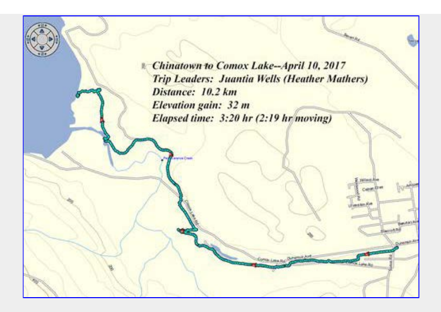
With the detour around the creek crossing, the total distance was 10.2 km