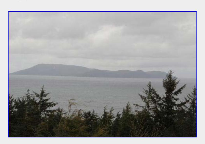
Scott Islands.