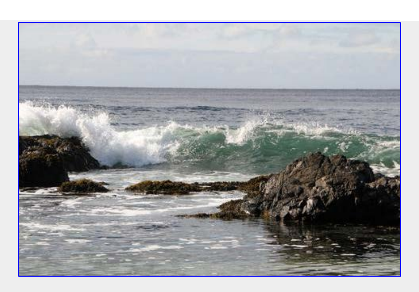
Crashing surf.