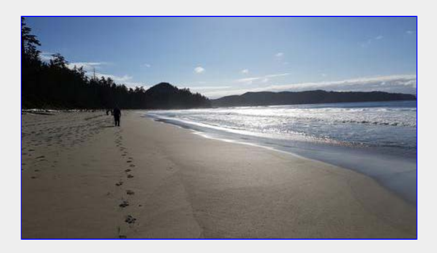
blue sky beach walkin'