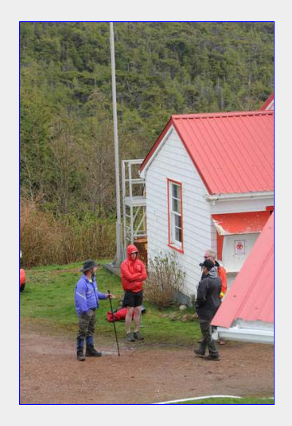
At the lighthouse.