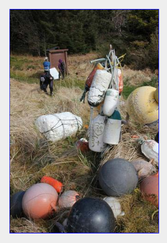
Where farming and fishing met.