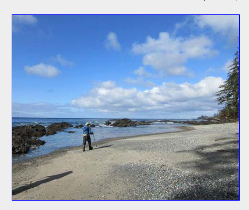
blue is beautiful