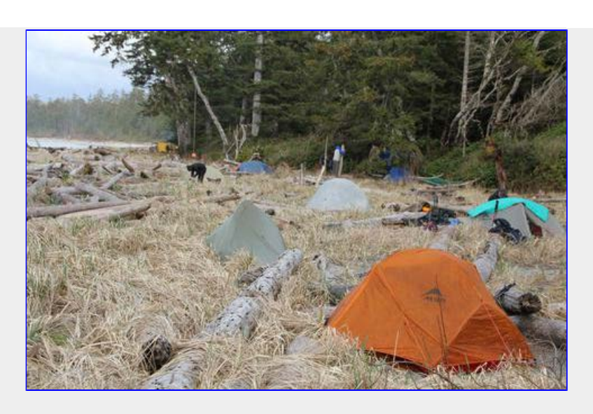
Camping near the surf.