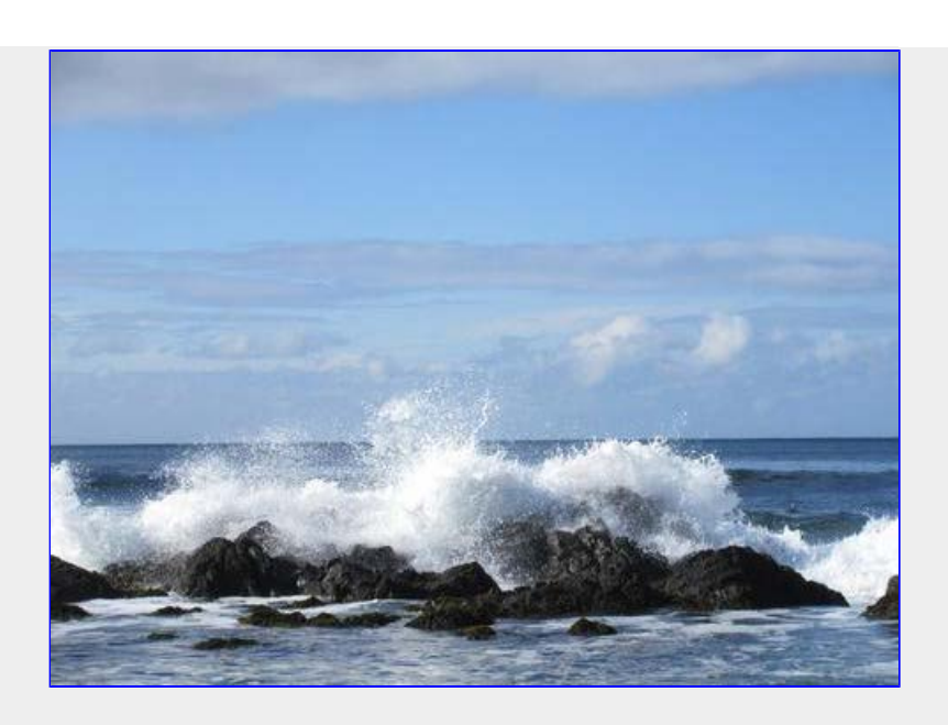
sunlit surf