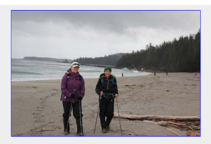
Sand, sea, and rainforest.