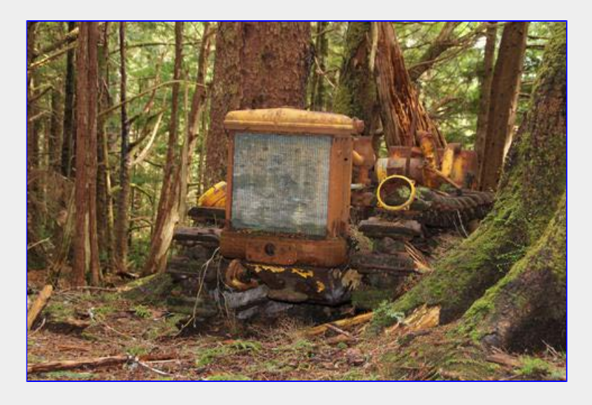
The tractor that lost to the rainforest.