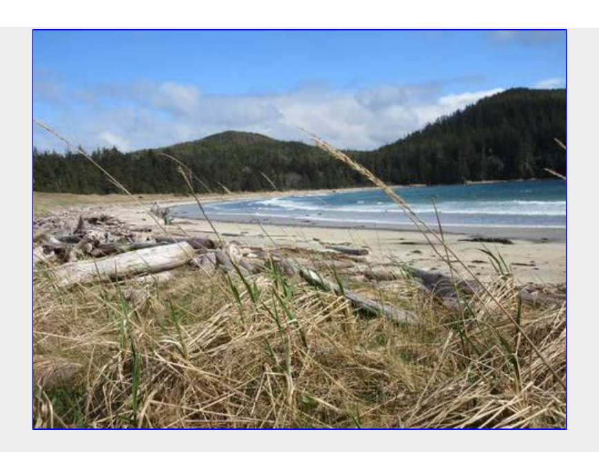
Guise Bay