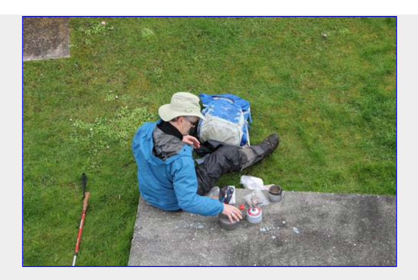
Lunch out of the wind.