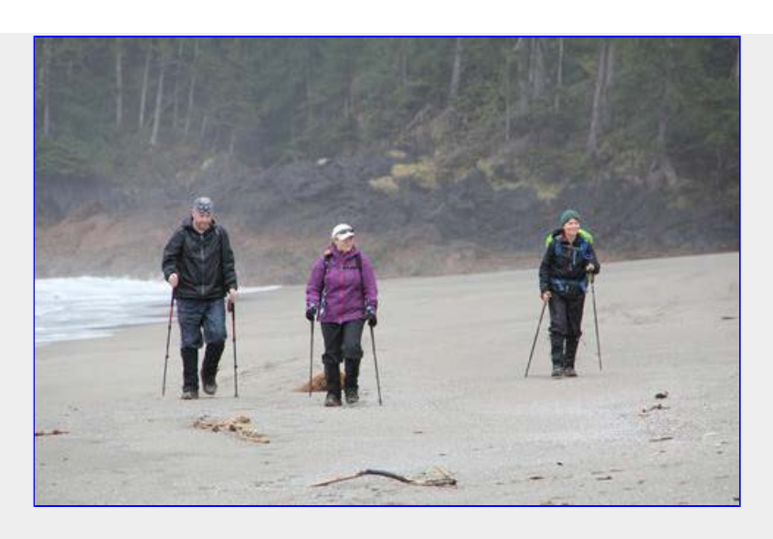
Much nicer than walking on corduroy.