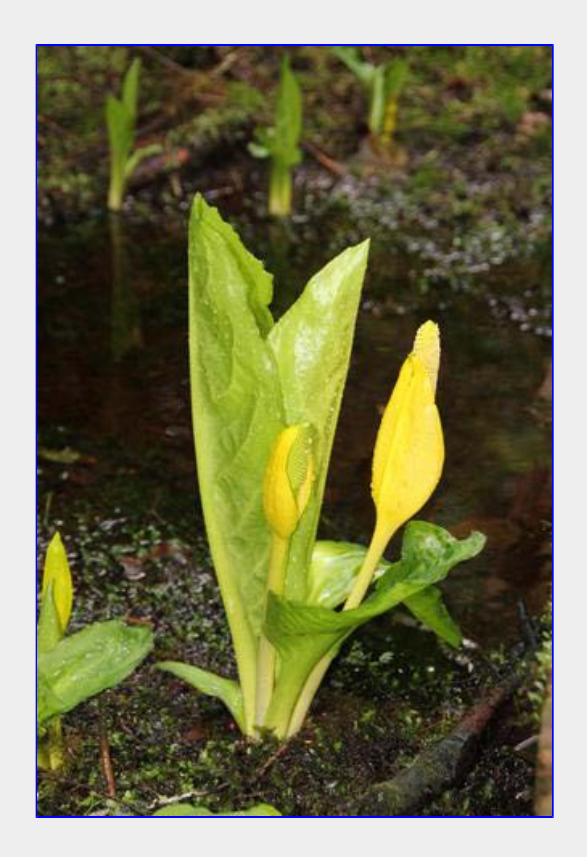
Underrated spring flower.