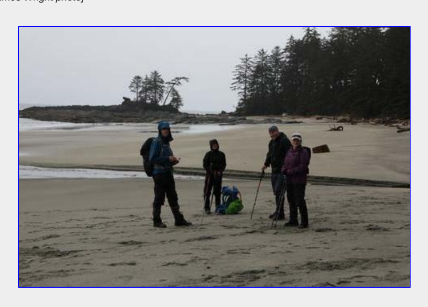
More contemplation.