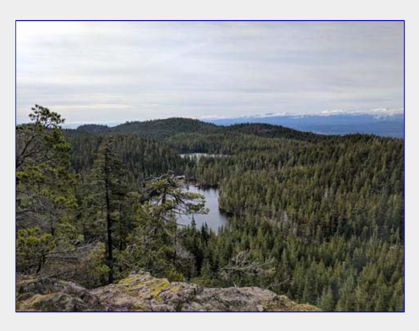
Nugedzi Lakes