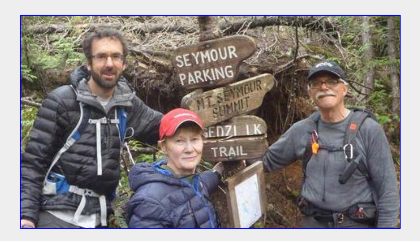
On our way to Nuzedzi Lakes