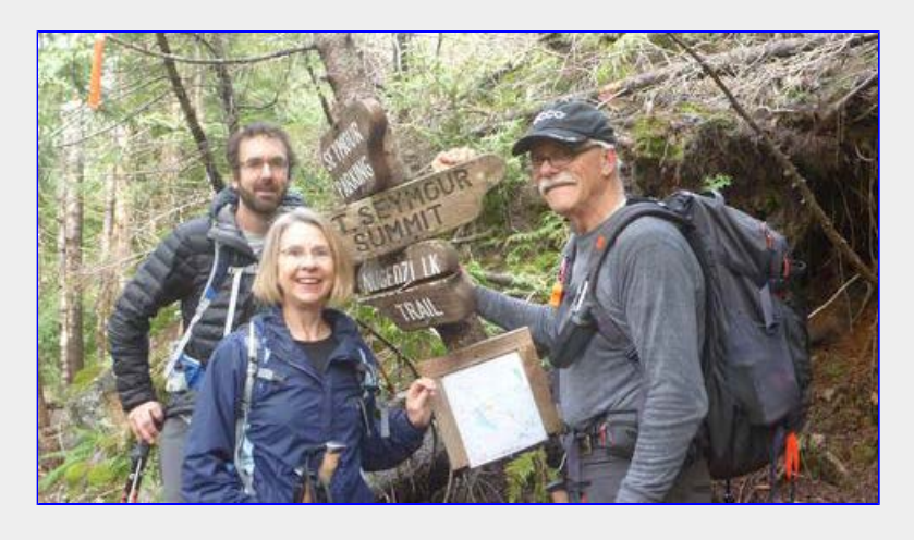
Easter Bunnies on route to Seymour Summit