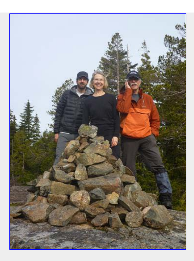
Our Club President calling home from the summit at Mt. Seymour