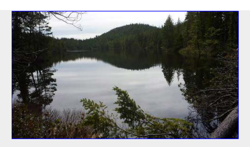
Nugedzi Lake