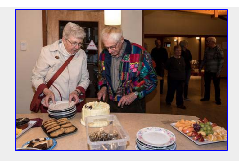
Perhaps a tad larger, dear.