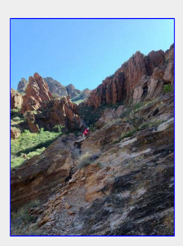
Arch Canyon, Organ Pipe Cactus NM, AZ.