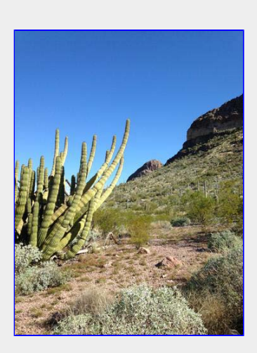
Organ Pipe Cactus, AZ.