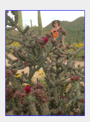
Desert blooms in Saguaro NP, Tucson AZ.