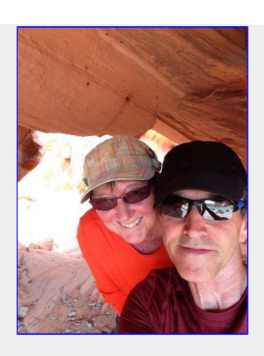
Desert relief under a sandstone arch, NV.