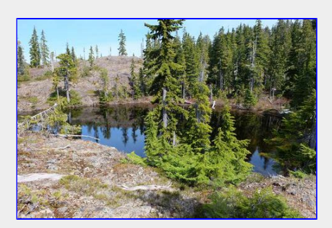
Ash Pond

An enjoyed walkabout on the eastern flanks of Forbidden Plateau and judging from all the beaming grins, all enjoyed as well or, maybe those were just grimaces?