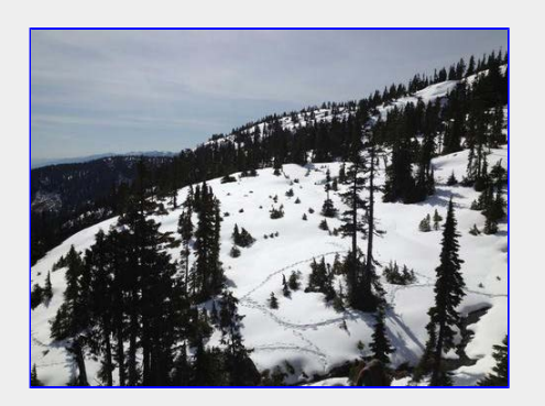
Making tracks