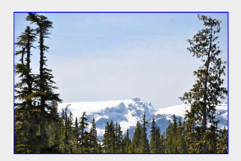
Comox Glacier & it's North Summit