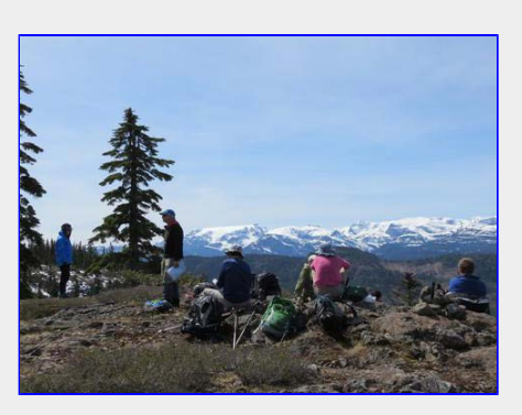
Lunch time with a great view at Ash Pond