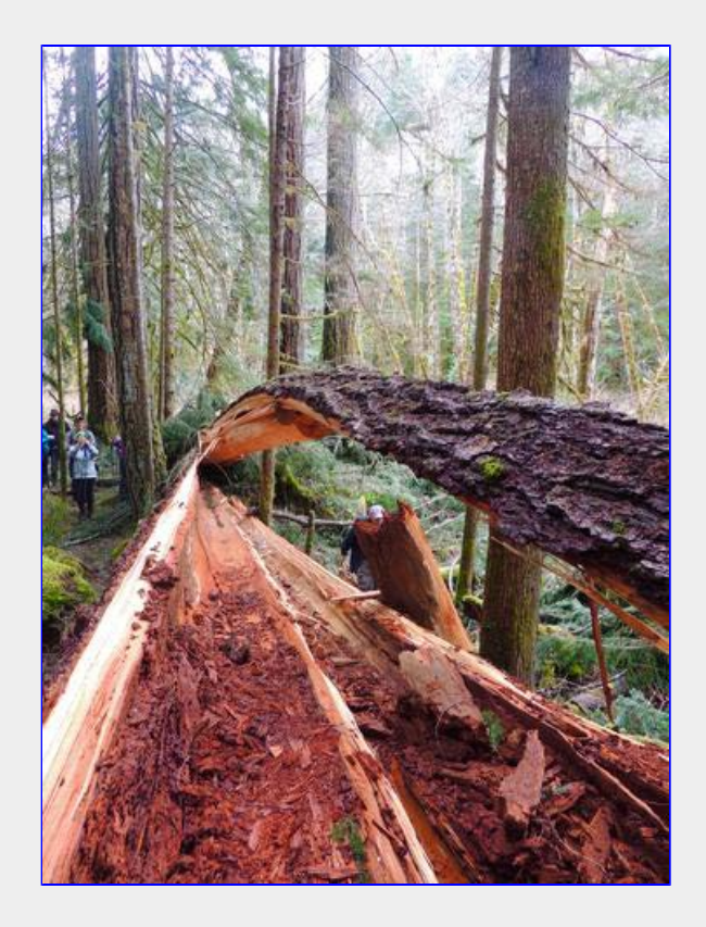
Mother Nature's Fury