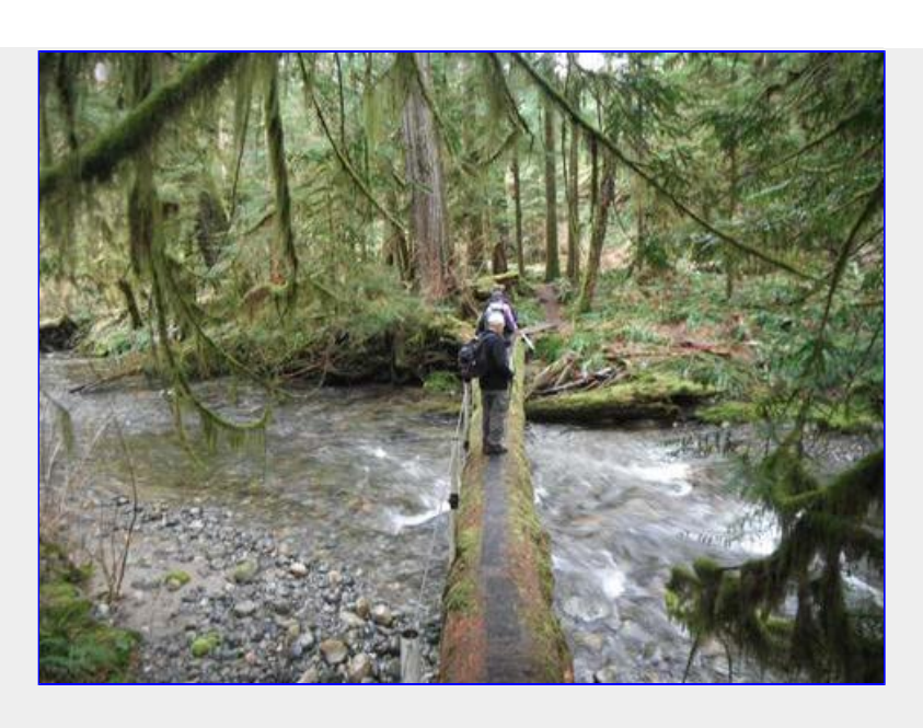
The 1st. bridge crossing.