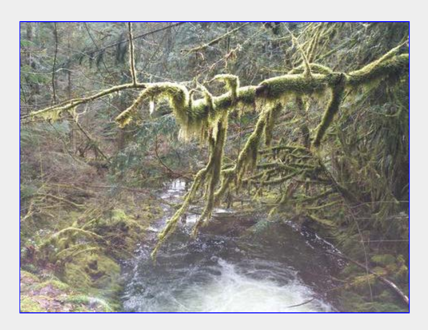
Can you see the M&M?