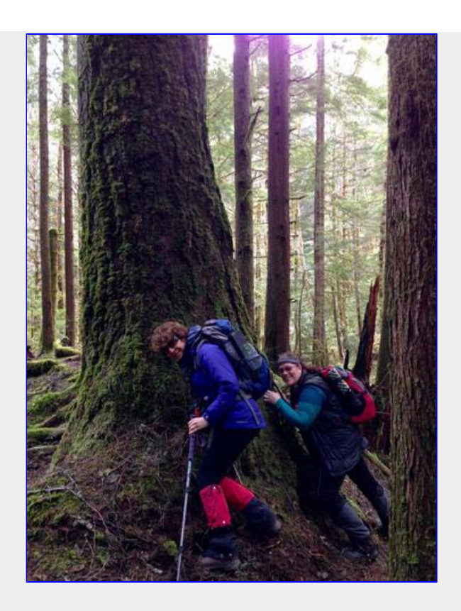
Tree huggers and hiders.