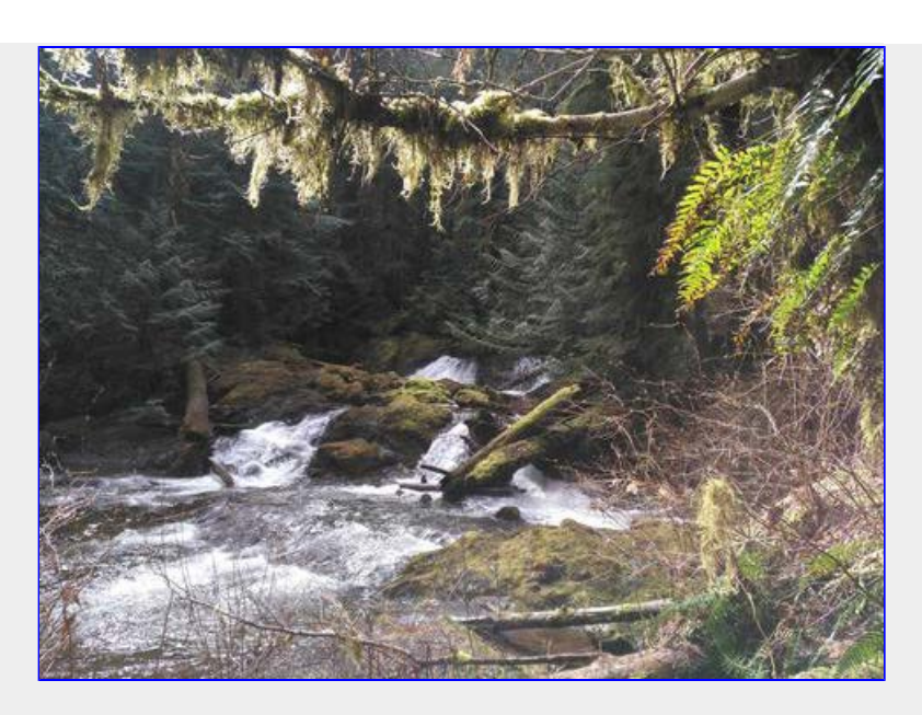
[Juanita Wells photo]