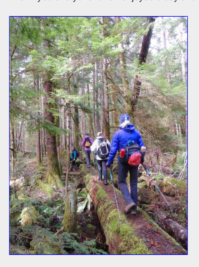
Another Log Crossing

Thank you everyone for an enjoyable day and your patient participation.