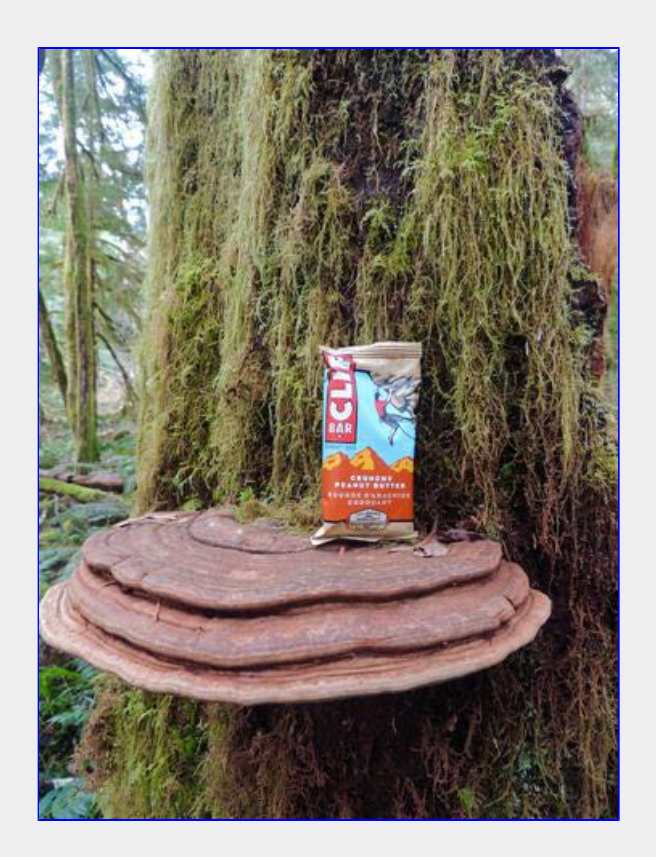
Snacks Served!