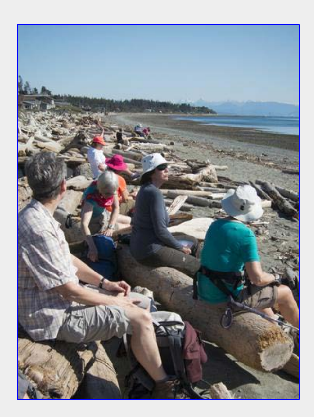
More coffee break