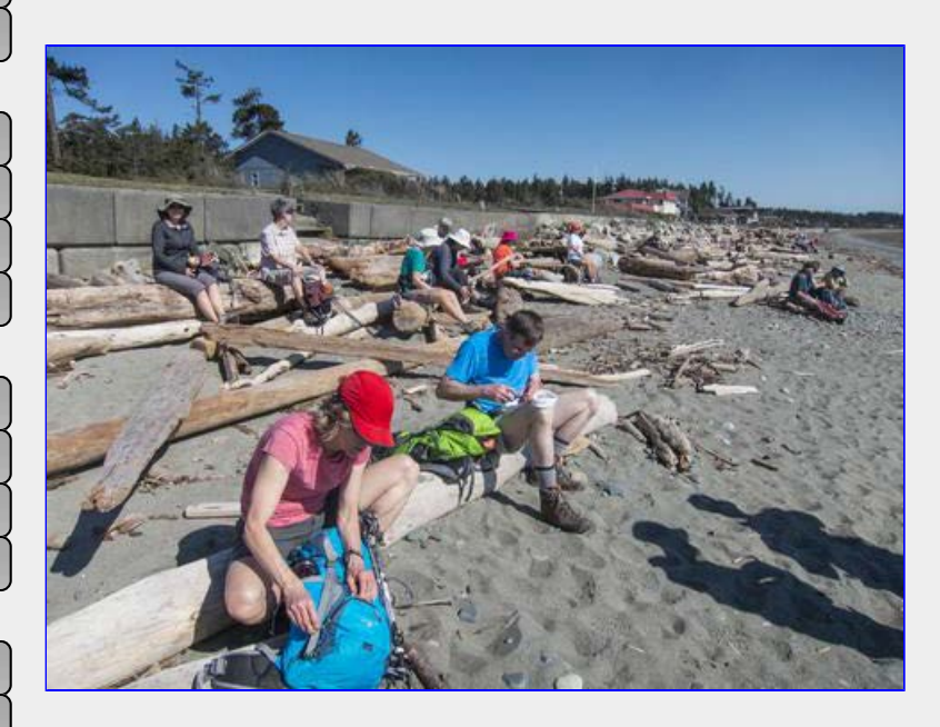
Coffee break Pt Holmes Beach

Just under 13km. the hike lasted 4 hours with 3 actually spent walking. Several members were introduced to trails and areas they had not explored before. No-one got lost and no accidents to report. A great morning.