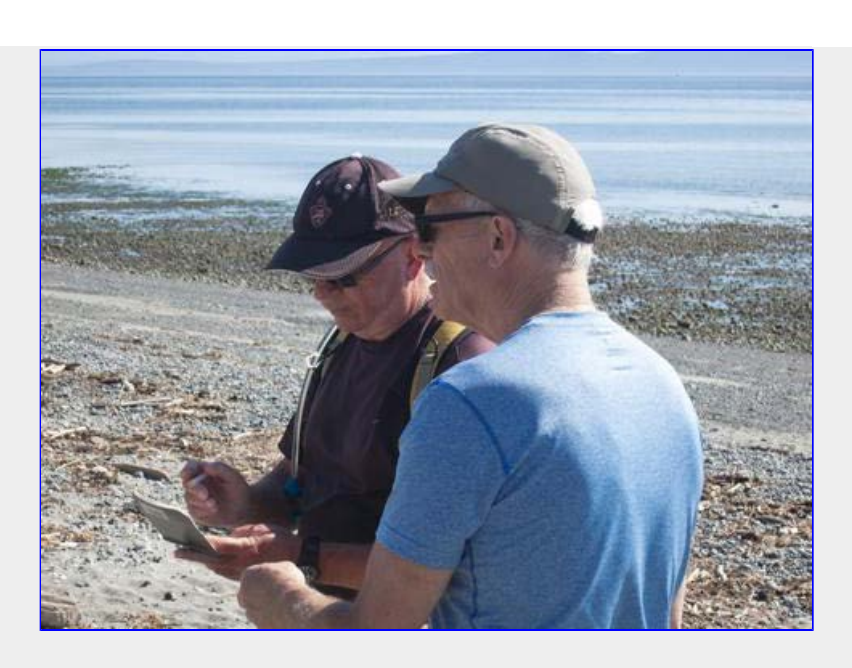
Making a note of where we are !