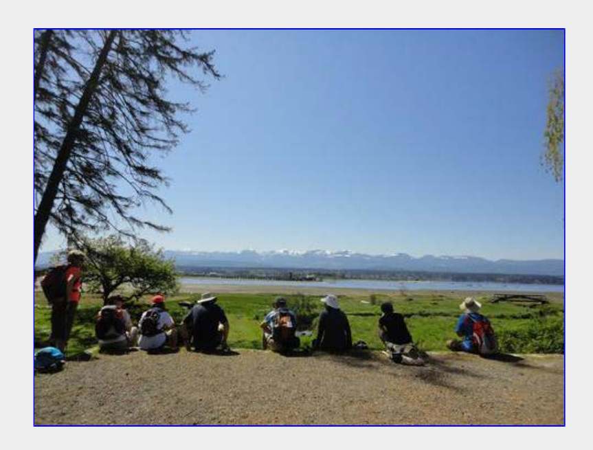
Beautiful view accross Comox Harbour to the Beauforts