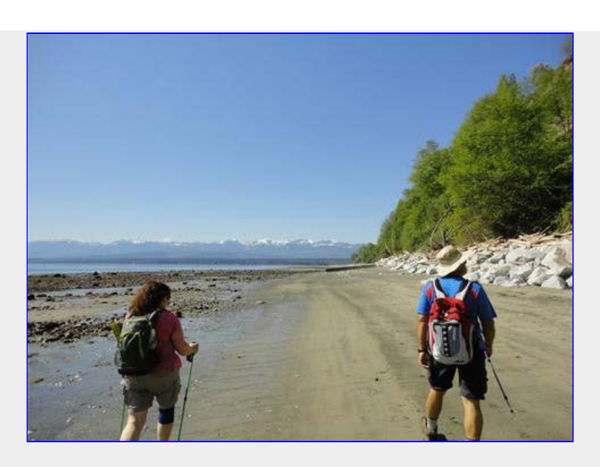
Gorgeous scenery everywhere you look