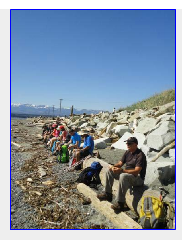
Chowing down near Goose Spit