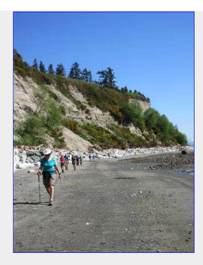
Stretched out along the bluffs