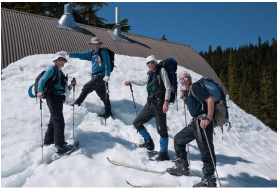
A quick stop at the Ranger's Cabin