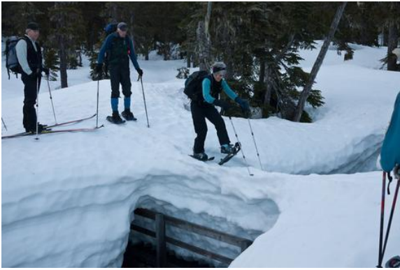
Crossing Piggott Breck Bridge