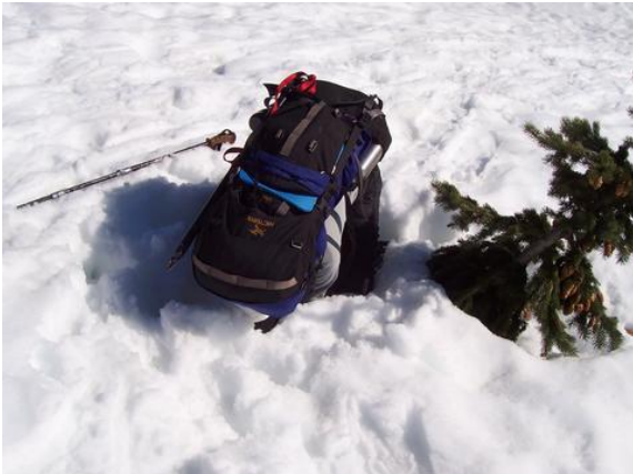
Anyone seen my snowshoe?