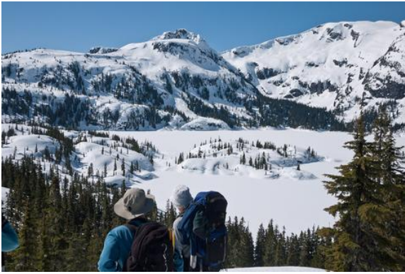
Looking down onto Stuart Wood Island