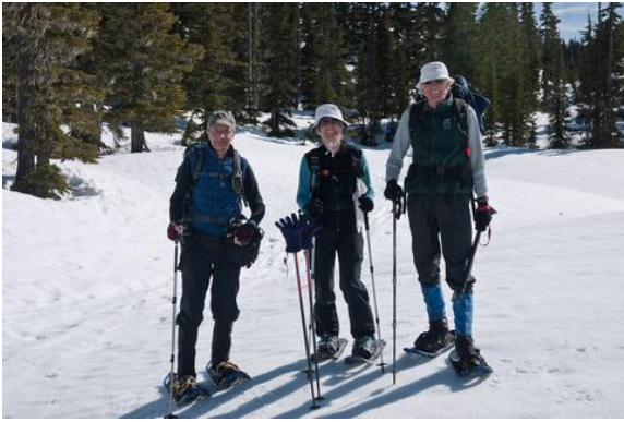
Hairtrigger Lake