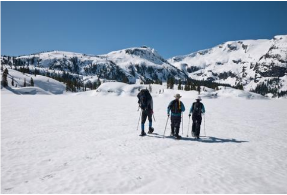
Heading to the Island