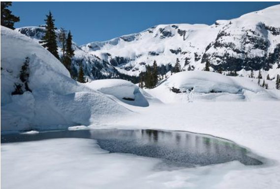
Castlecrag just visible to the left