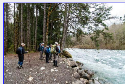
Puntledge River at the start of the trip