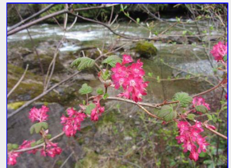
flowering currant near Brown's River