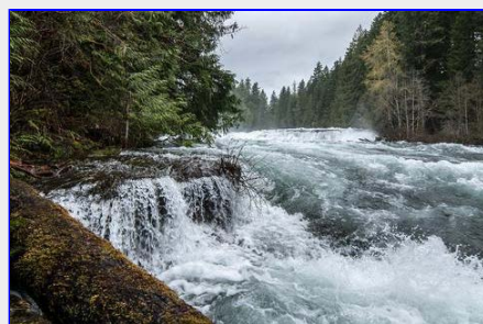
Looking upstream to Stotan Falls