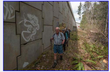
Alongside the Inland Island Highway underpass