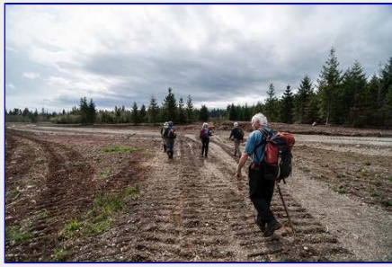
Open development area off Duncan Bay Main Line