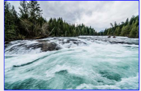
Oil Painting effect - Looking towards the submerged fish ladder