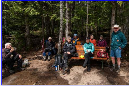
Lunch stop at Nymph Falls