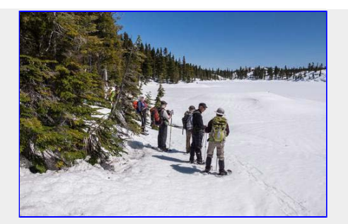
Johnston Lake