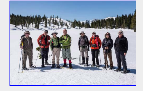
The group on Croteau Lake