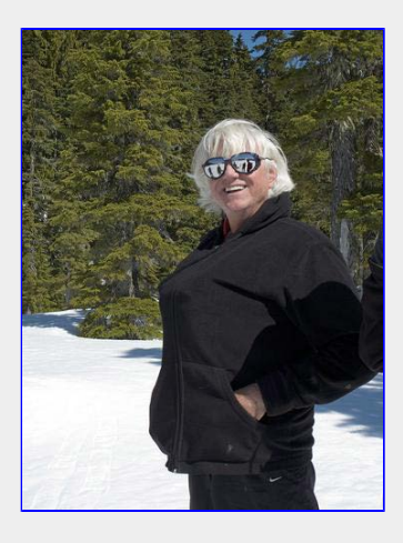
We had a new guest on the trip. She's a doll!