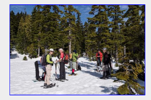
First break at Battleship Lake