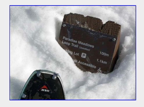
We knew there would be enough snow from the start!