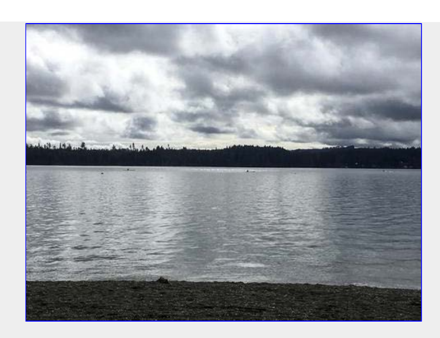
First two kayakers crossing Comox Lake on Snow to Surf race