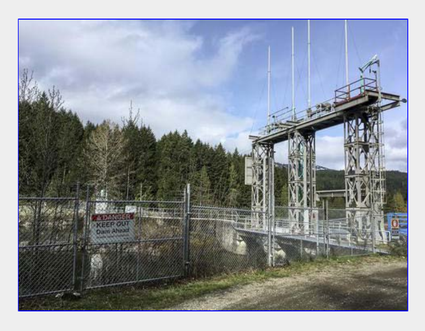
Comox Dam, almost to the lake