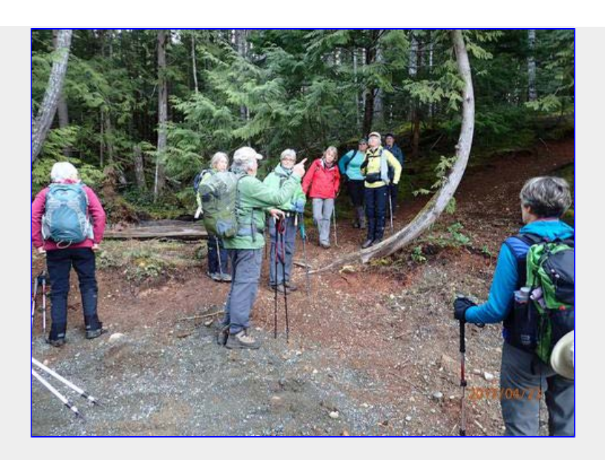
Short break at the Beginning