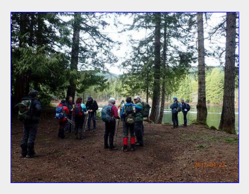
A perfect swimming spot for me.