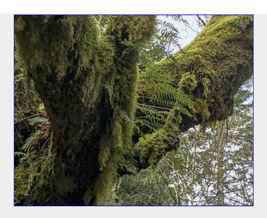
Moss and licorice ferns cover the trees