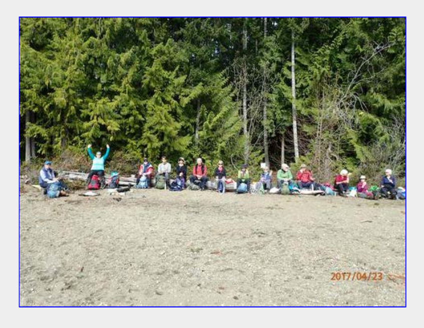
Our lunch spot. Perfect to see the kayakers from Snow to Surf race