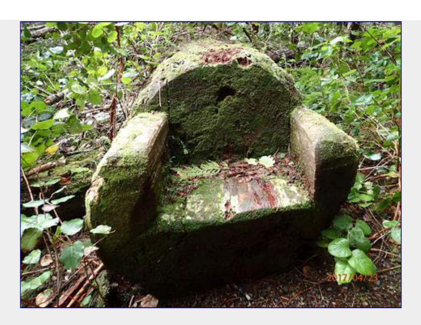
On the way back - a nice place to rest