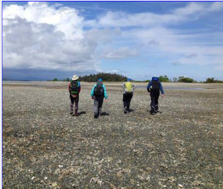
Those Warm Winds Arriving!