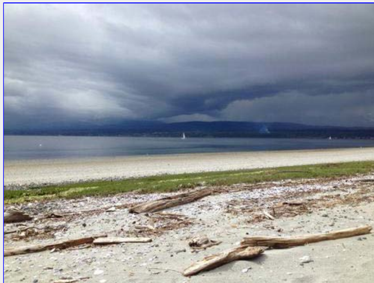
Nature's Splendour