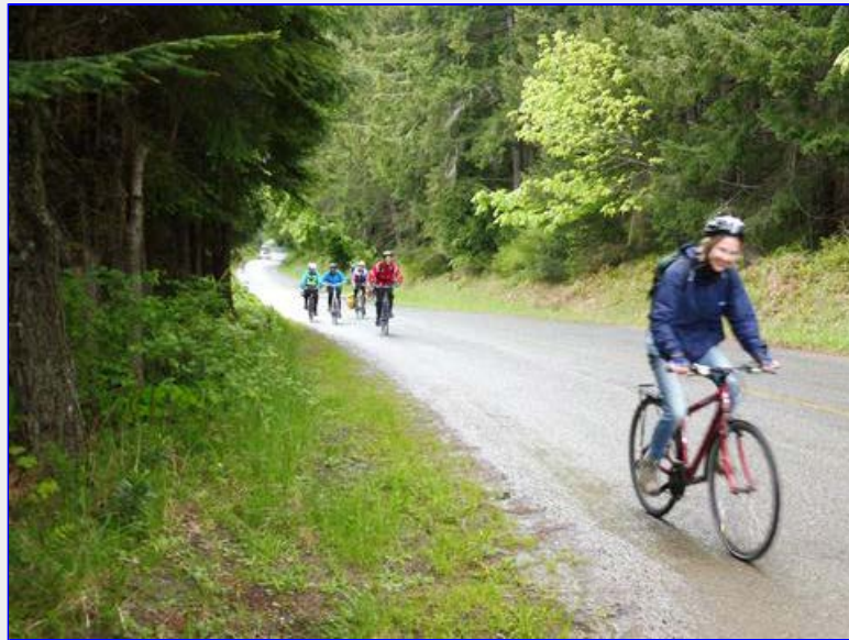
Just getting to the top of the last gentle climb on the way back