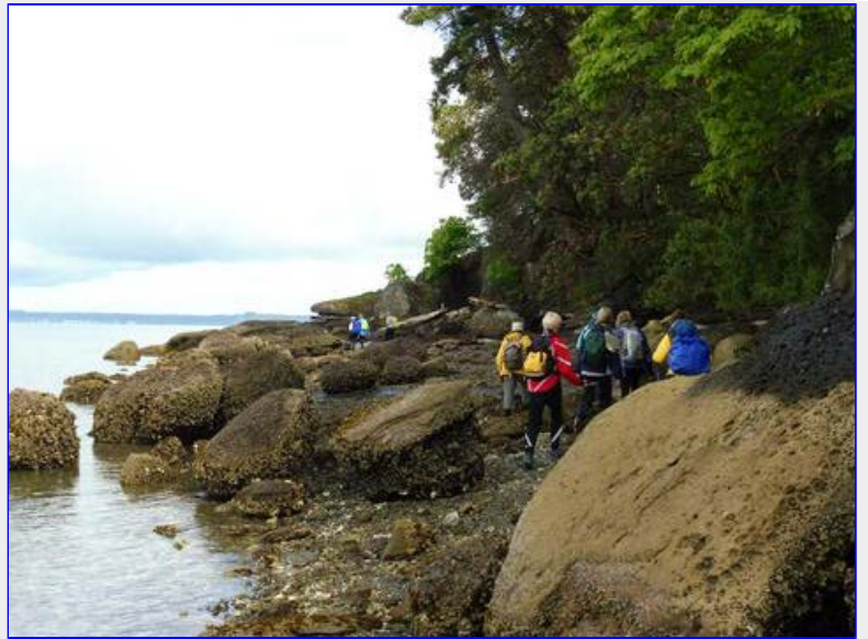
Tide wasn't quite low enough so we did a little scrambling to get by