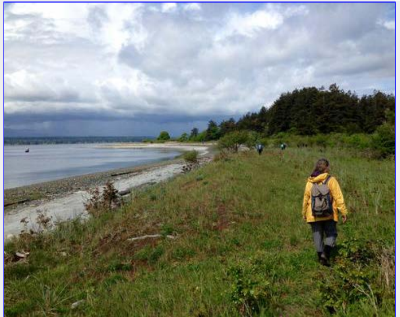
Headin' Home