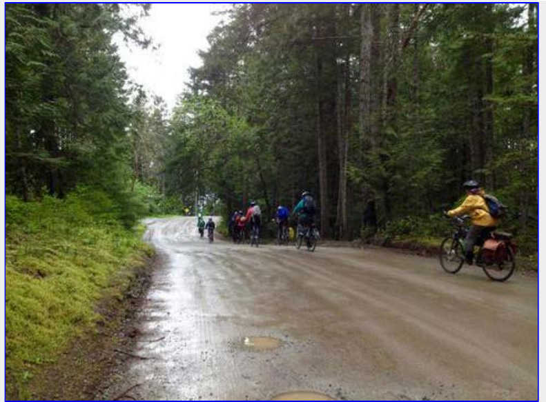
Making Our Way to the Trailhead