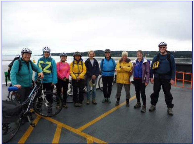
All safely (and almost dry) aboard