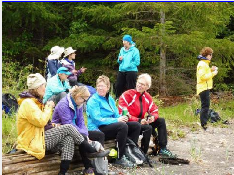
Short rest around midway on the beach walk portion