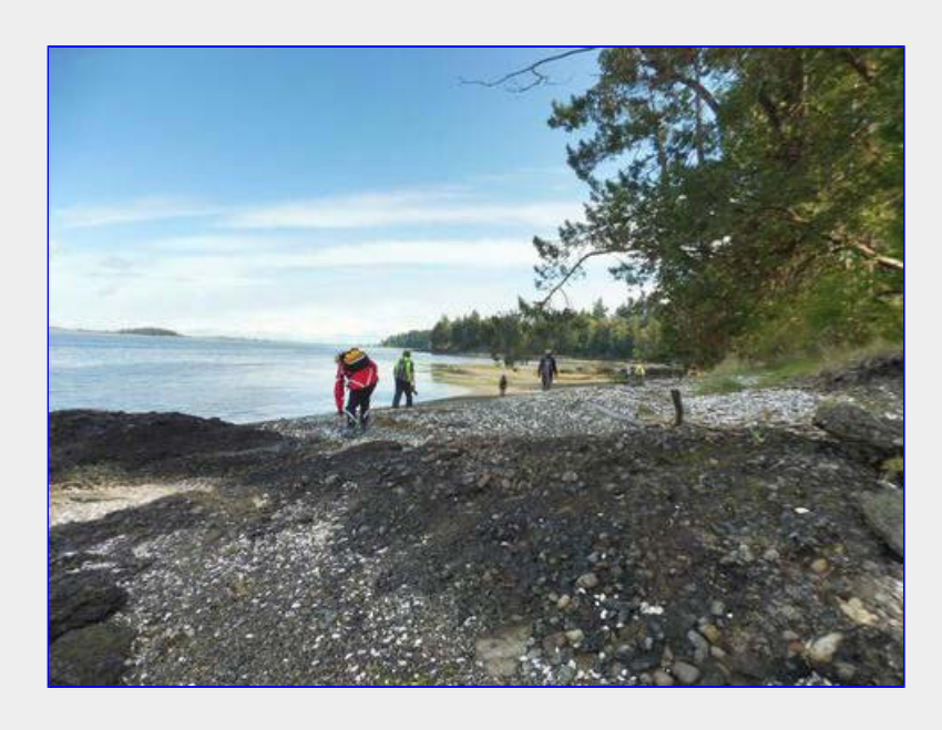
Tides out, suns out, we're out.....great day to be out enjoying spring