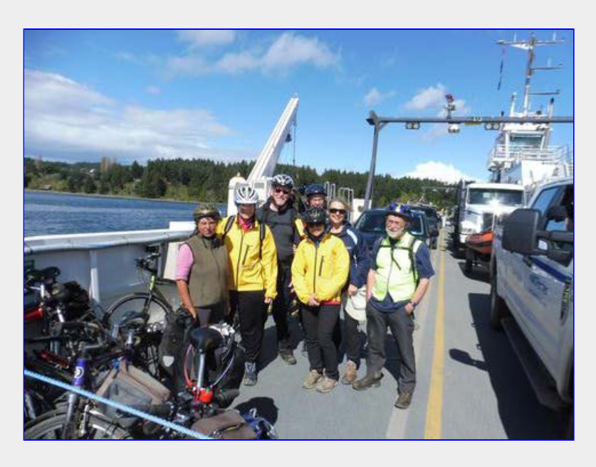
Our still energetic crew returning on the ferry