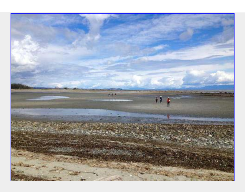
Making Our Way to Tree Island