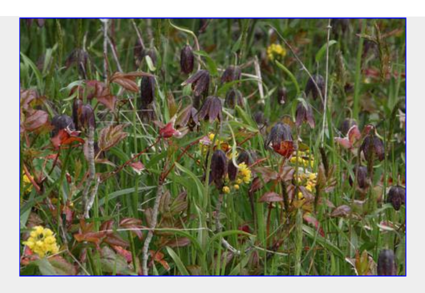
Chocolate lilies in meadow of flowers