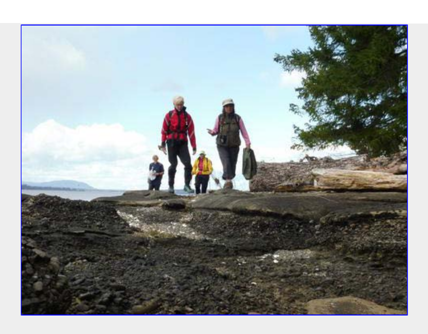
Working our way back along the rock shelves