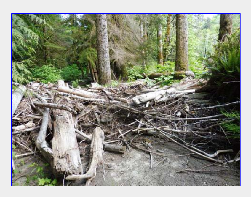
Plenty of evidence of recent floods