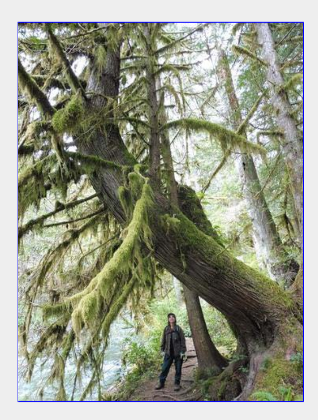
The enchanted forest.....