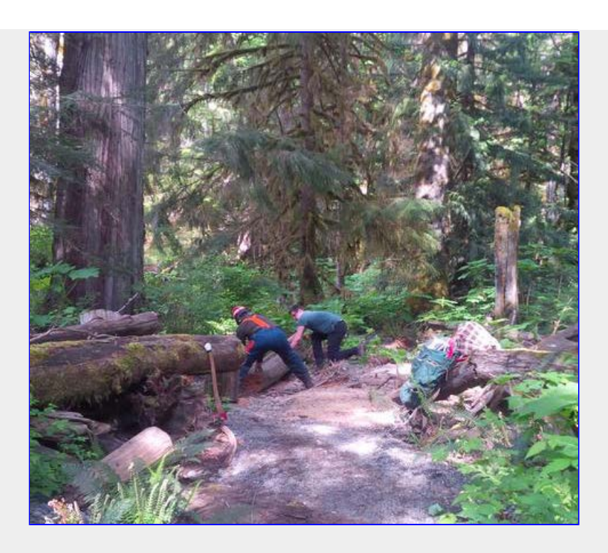
Flexing their muscles :)