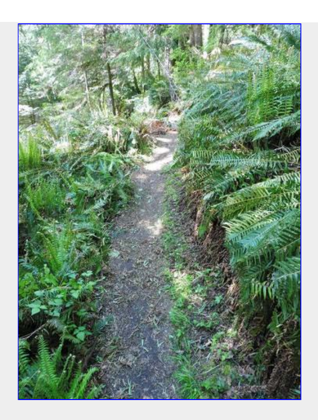
The finished product!