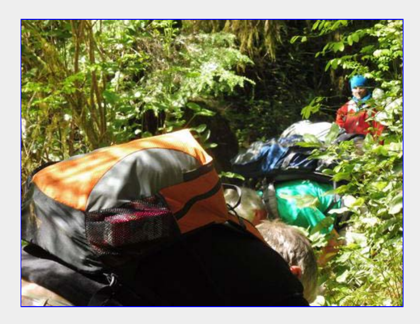
Strange coloured crabs crawling along the trail