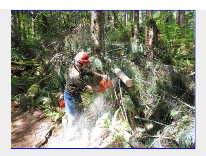
Otto at play