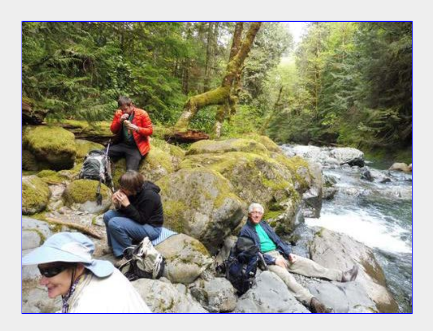
Lunch at the falls