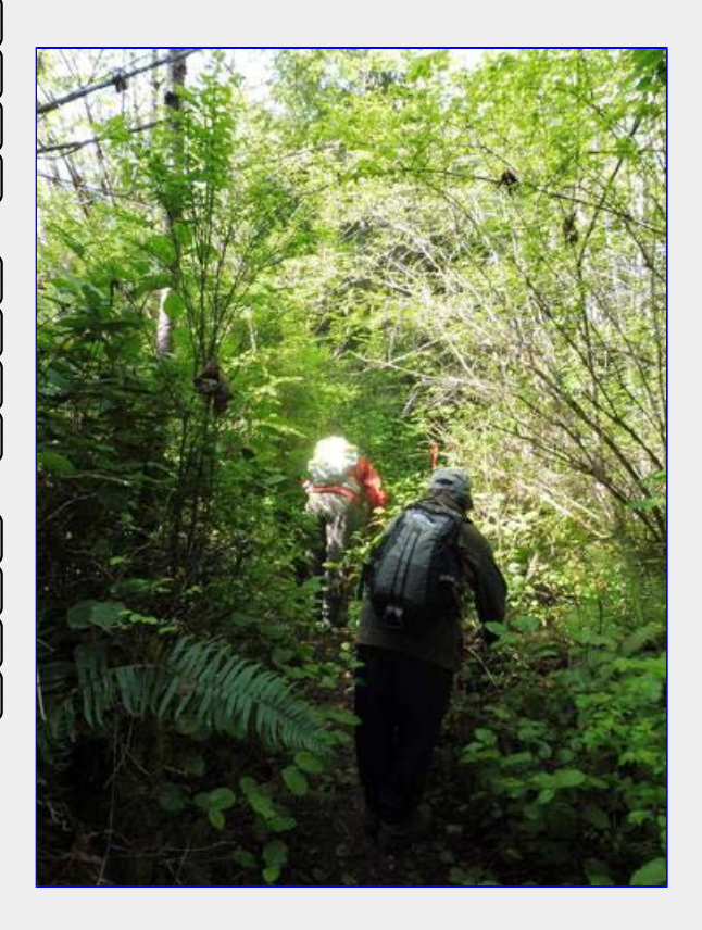
Getting started on the day

Under clearing skies all of the work party members met up at the trailhead parking, signed all the necessary paperwork and headed into the bush at approx. 10am. After crossing under both highways and the train tracks the work started about 10 mins up the trail near the old flooding and log jam area. Devil's club alongside the trail was removed while Otto and Thomas stopped to cut out one of the many windfalls that would need to removed from across the trail. Everyone then continued to clip back the overgrowth on both sides of the trail all the way to the falls. After a good lunch break at the falls the group then continued back on the same trail tidying up a few missed areas on the way arriving back at the vehicles at approx 4pm. A huge thank you to all who turned out for this work party. Your time and cooperation in making this a very productive and safe day is greatly appreciated. Great job!!