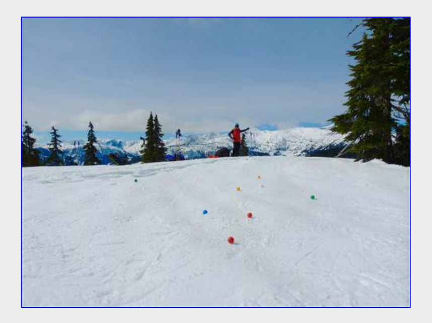
A Fabulous Backdrop for our Tournament

Let Go My Bocce Ball!!