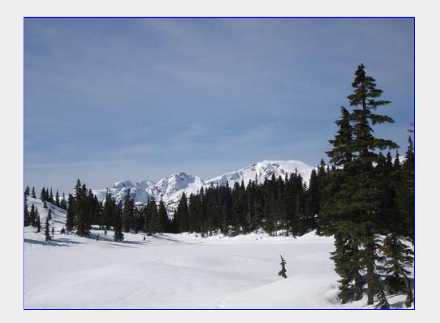
Arriving at Croteau Lake, looking South to Castlecrag.