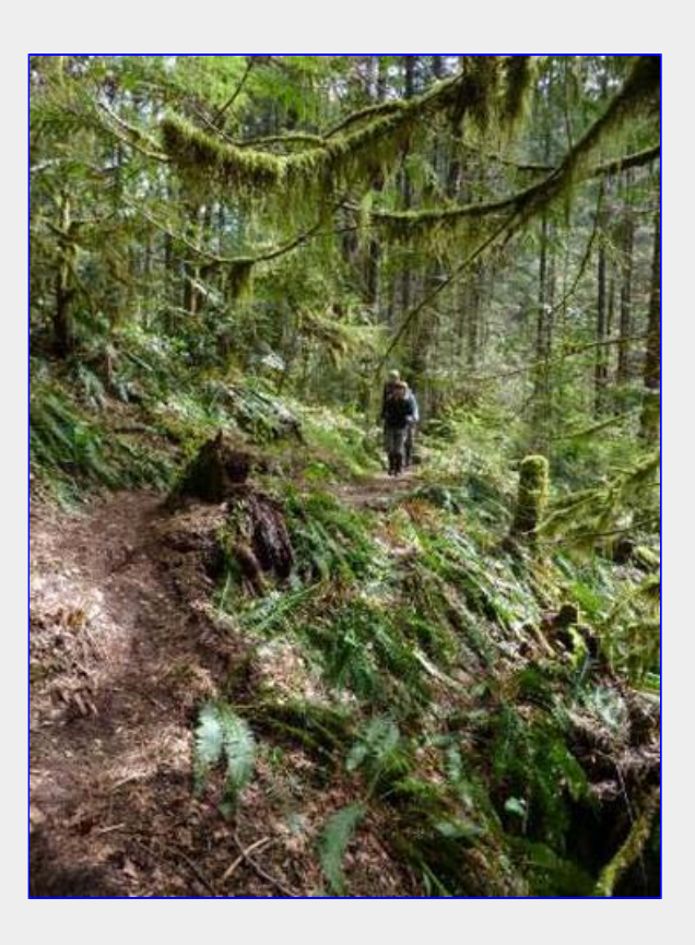
Magnificent woods [Melanie Bagley photo]

Relaxing in the glade [Melanie Bagley photo]