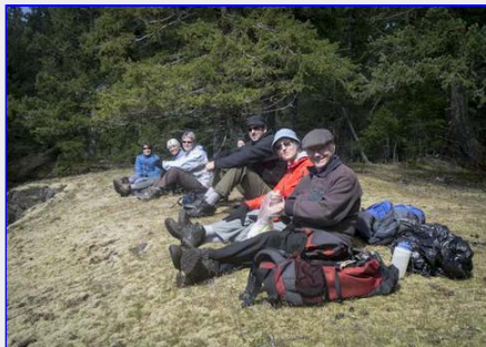
Enjoying the Sunshine