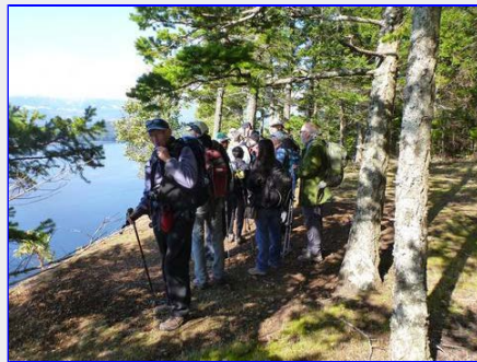
Enjoying a Middle Bench viewpoint

We made it to our destination around 12:30... with some lounging on the high point, with others opting for more sun a little further back. The return trip had a bit of excitement with some missing an intersection (but only for a little while), and another picking the wrong moment to visit the washroom, only to miss the Hornby ferry. This too was resolved successfully. A fun trip with a great group of hikers... thanks for coming along!