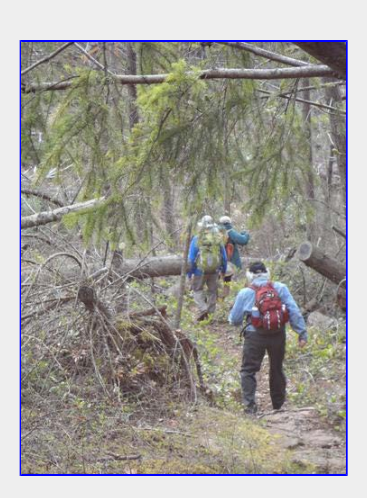
[Michele Hind photo]

Supply Creek from Catnip [Michele Hind photo]