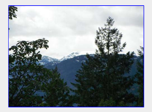
Glacier Glimpse