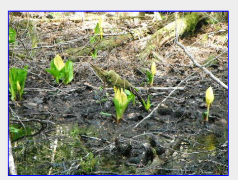
Spring Springing

Always a good day, especially in the hills and a bonus with a better than anticipated forecast along with an enthusiastic group.