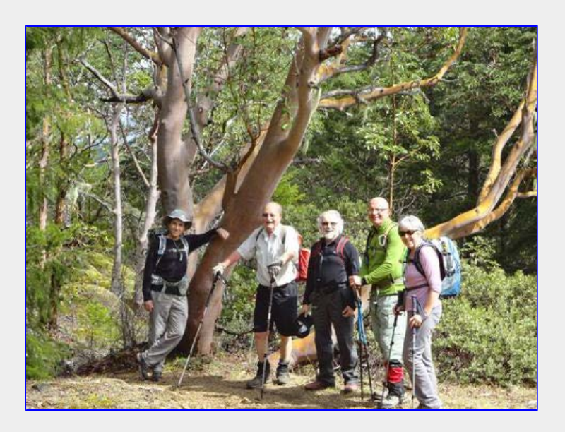
pausing on Comox Bluffs