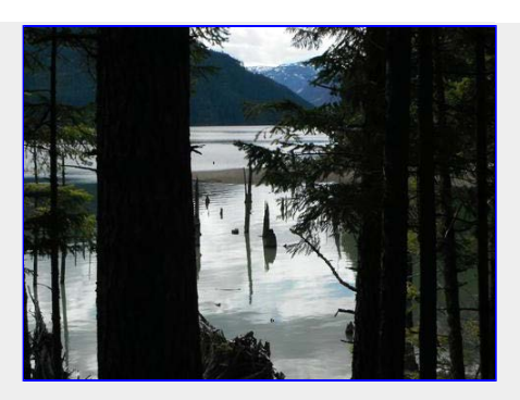
Lake from Forested Shadows