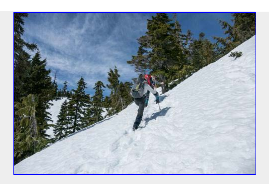
Steep side hill at the upper gully