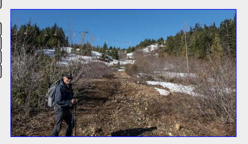
Not much snow today at the start of the hike

We completed this trip 2 minutes faster than the club trip on February 8th and spent 1 minutes less time for lunch.