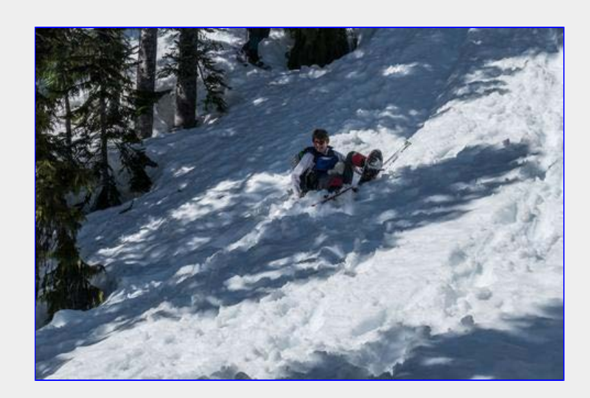
Quick way down the steep gully side wall