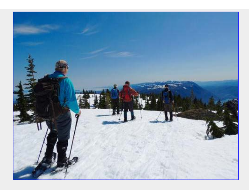
Heading back after a splendid day in our backyard