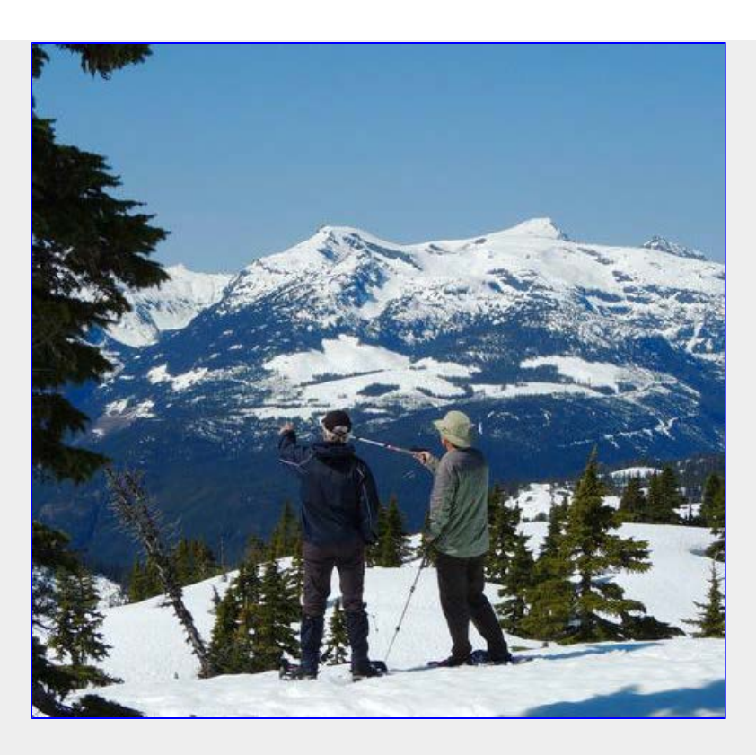
Scouting our future hikes!