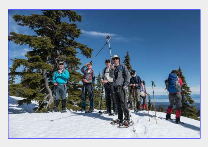
Is that another Snowbird I see?