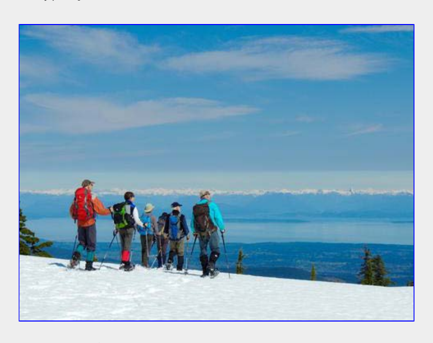
One more look before heading down