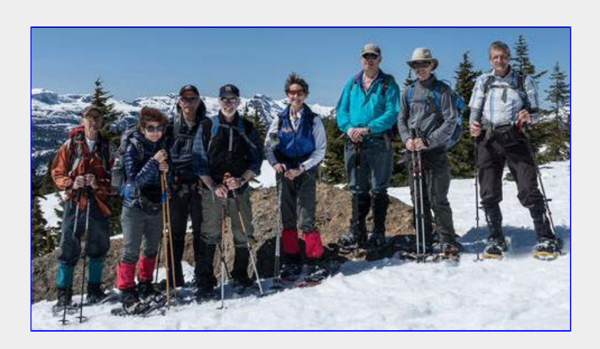
Summit group shot