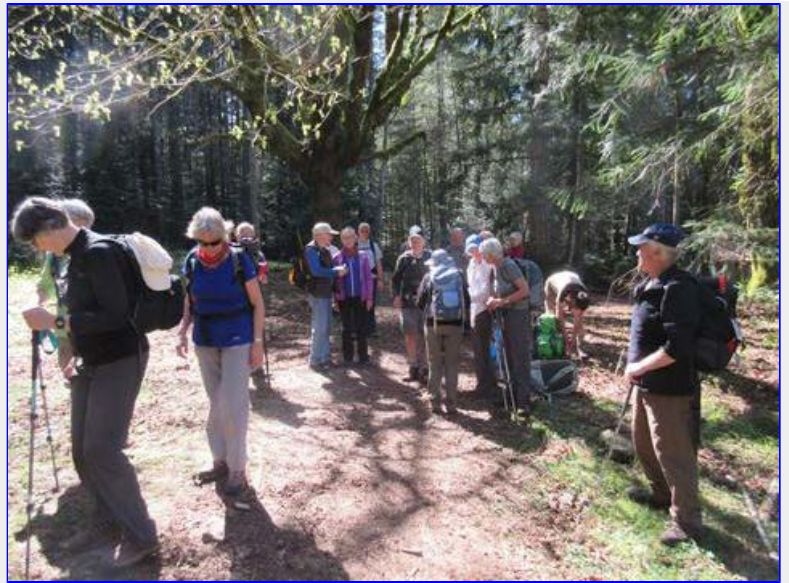
Loo stop