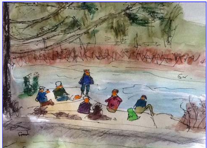
Lunch at the Dam Sketch