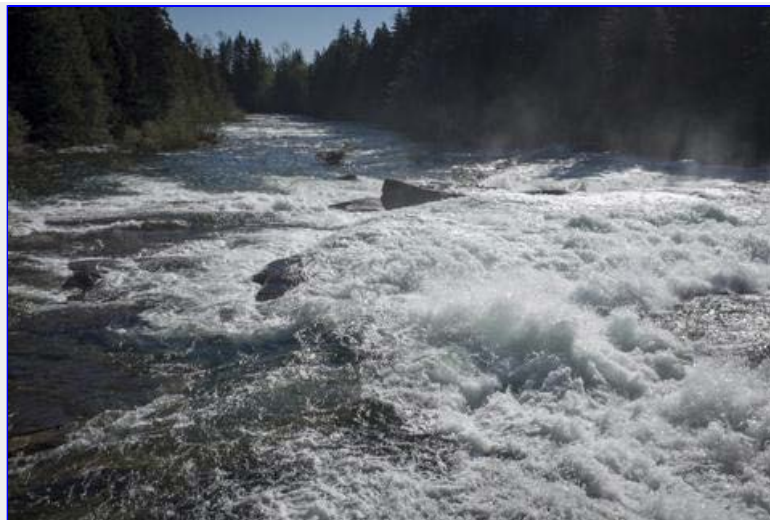
The warm weather causing a good flow in the river.