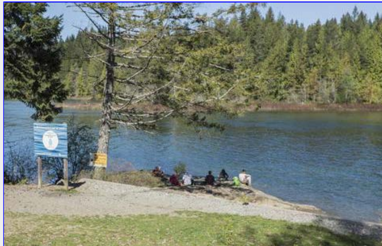
Lunch at the Dam