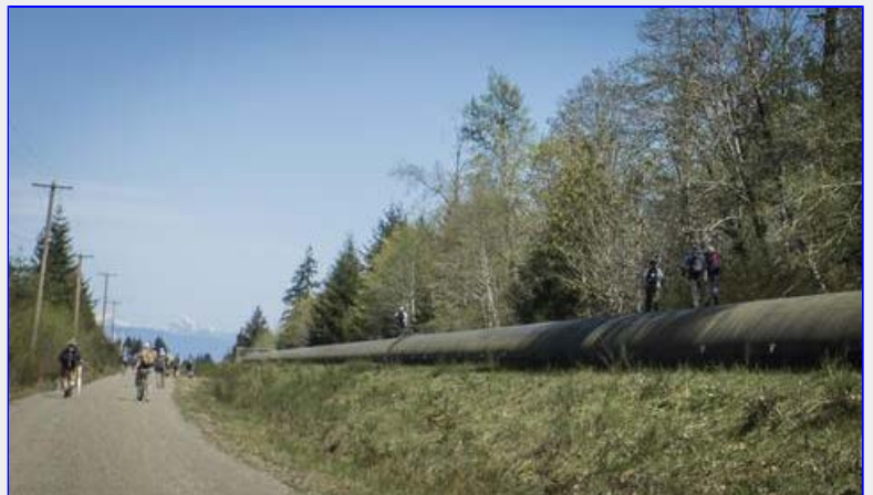
Pipeline walking is good for your balance !