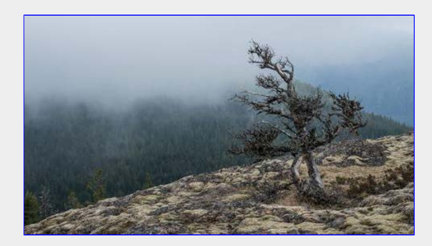
Not very good views today