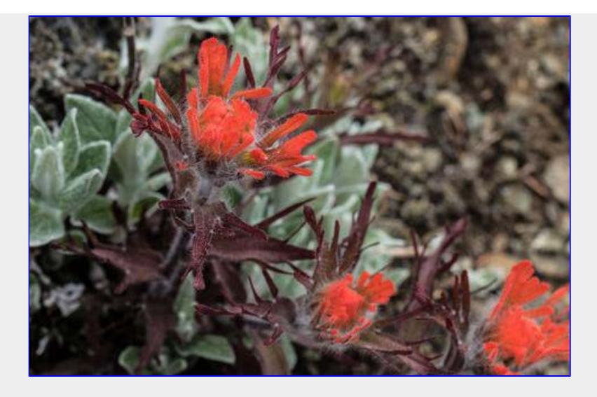
Indian Paintbrush in full bloom