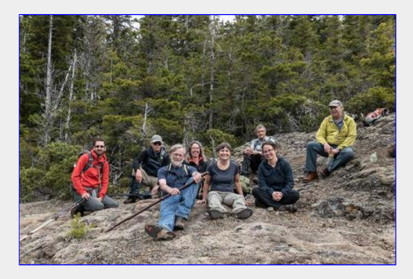
Group shot at the third lookout