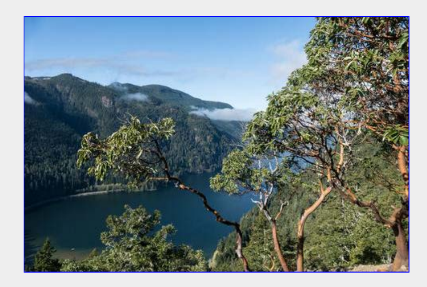
First view back down to Cameron Lake at the start of the ridge