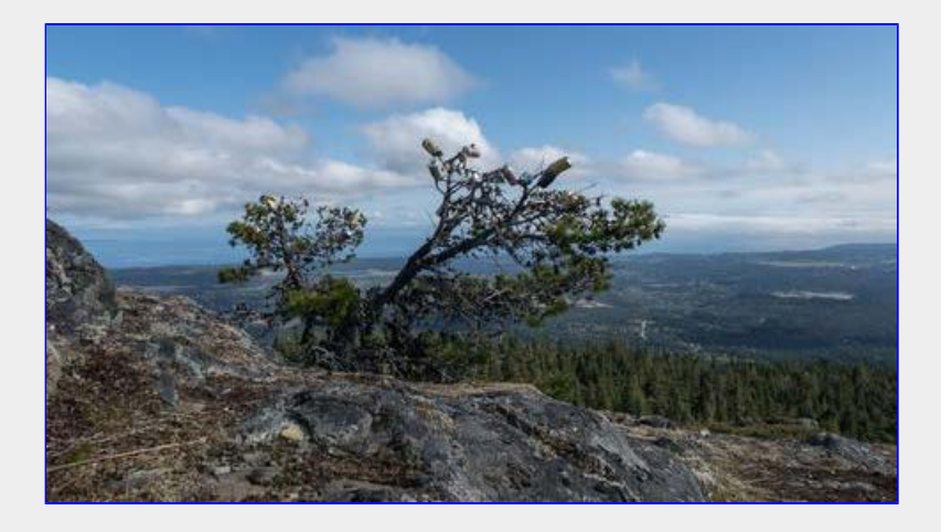
A new species of tree - The stunted Beer Can Pine