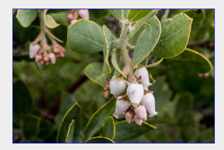
Most of the Manzanita bushes were in flower