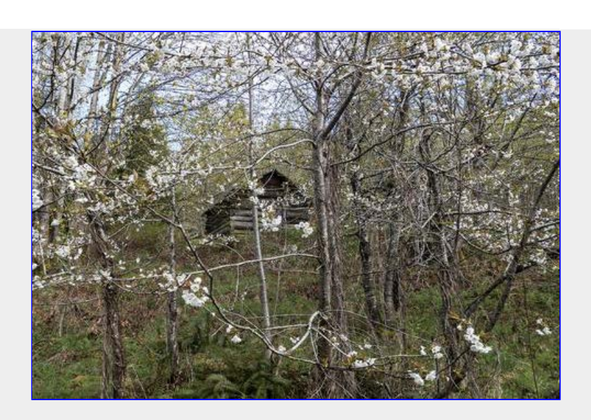
Jumbo's cabin