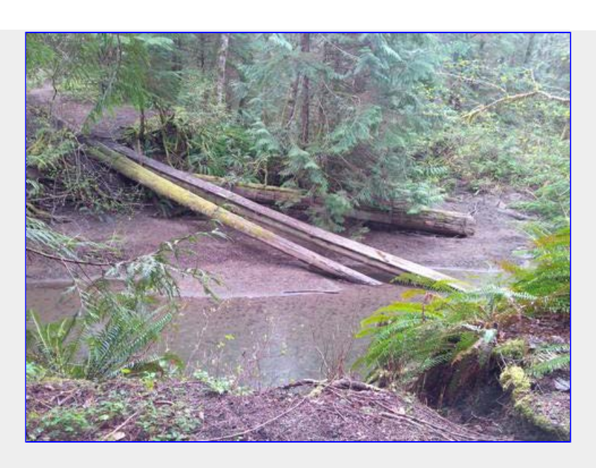
The bridge that no longer gets you to the other side....