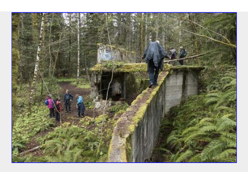
Ed balancing on an old mine structure