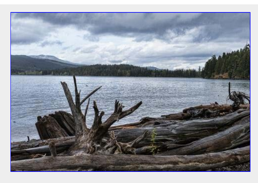
Coal Bay view of Mount Washington and Cougar