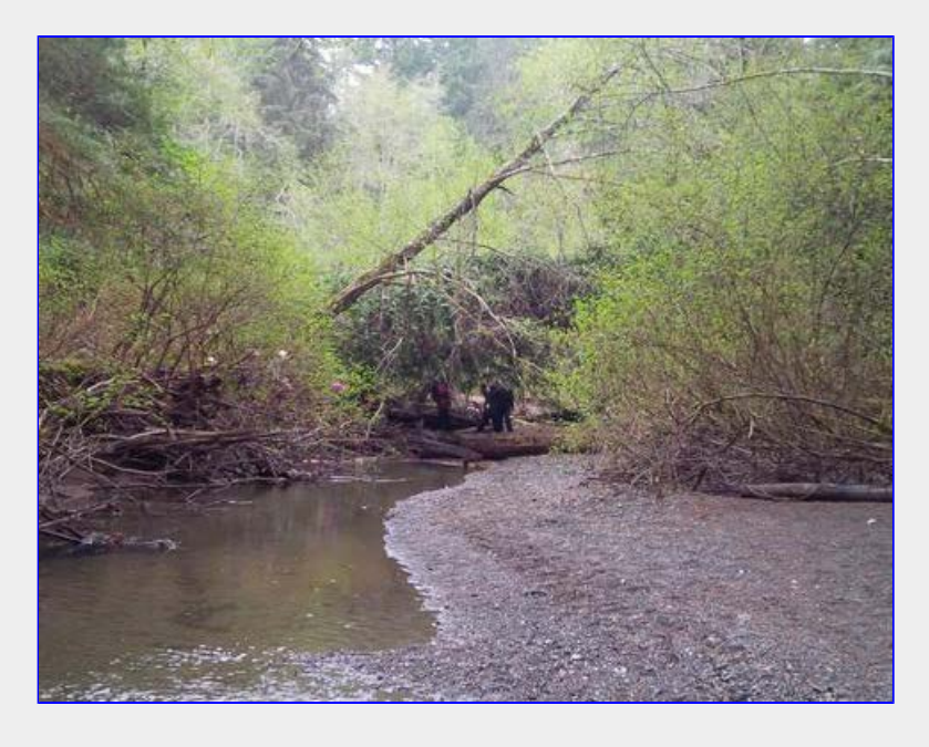
Crossing on the log jam....