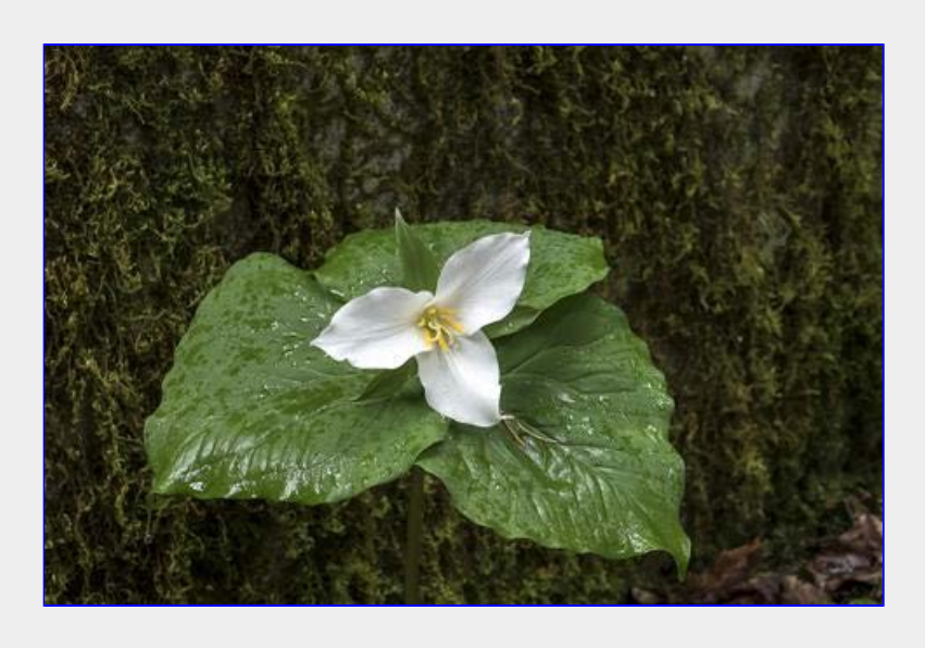
Trillium in the rain