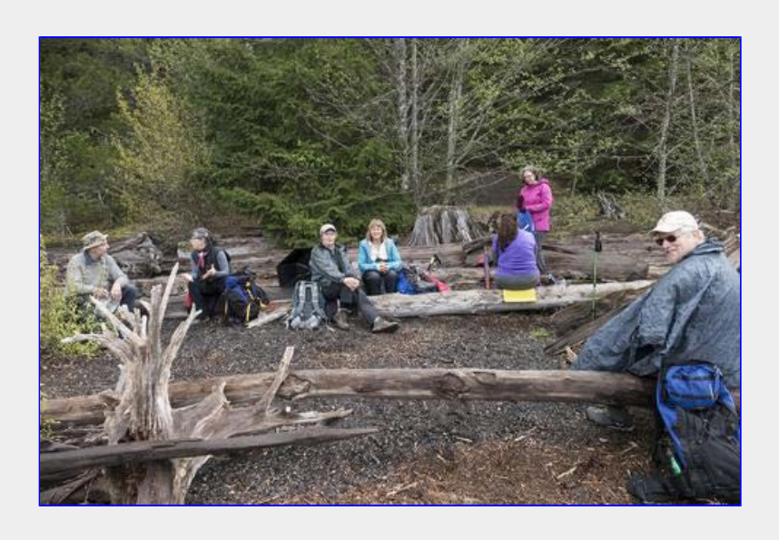
Lunch at Coal Bay on Comox Lake