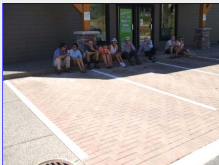
Kids with their ice-cream.