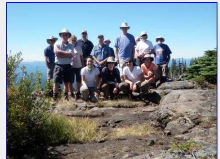
Summit group shot