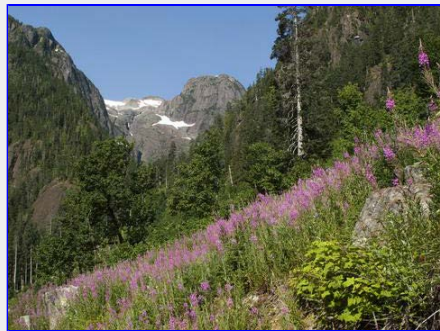
At the trail head with view of north aspect of the Comox Glacier

More photos from this trip can be seen here.