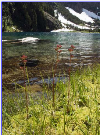
Leatherleaf Saxifrage at Century Sam Lake