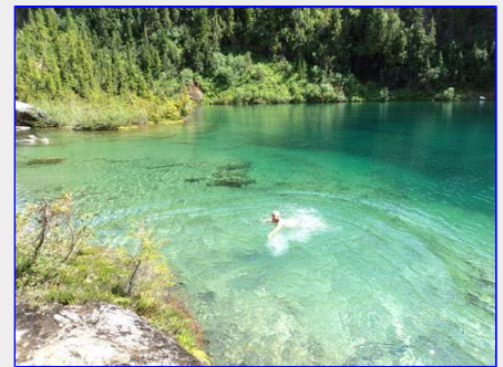
Taking a dip in the crystal clear lake