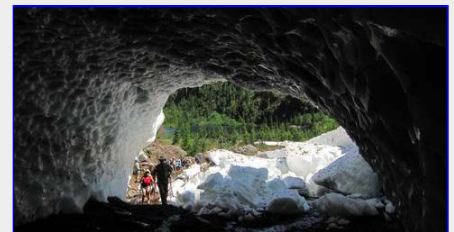
Trip leader entering the snow cave