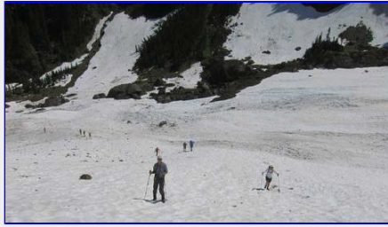
CDMC members exploring the snow field