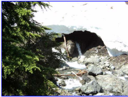
Cave below the lake