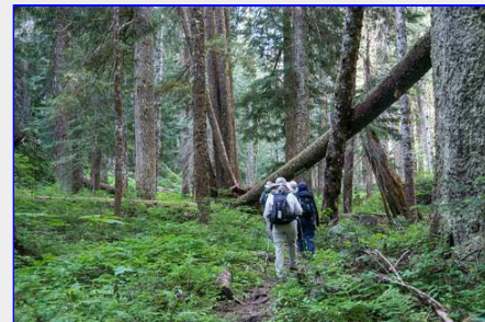
Just starting out on the trail