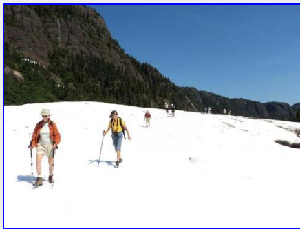
Traversing the snow field