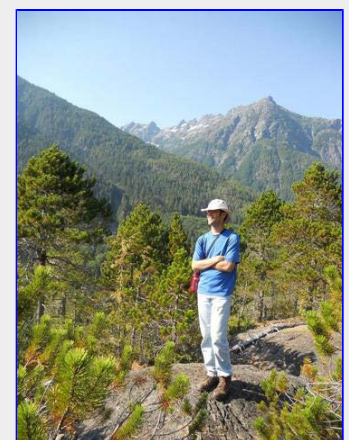
Mariner Mtn.