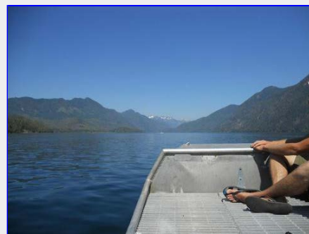
Water taxi up Bedwell Sound from Tofino