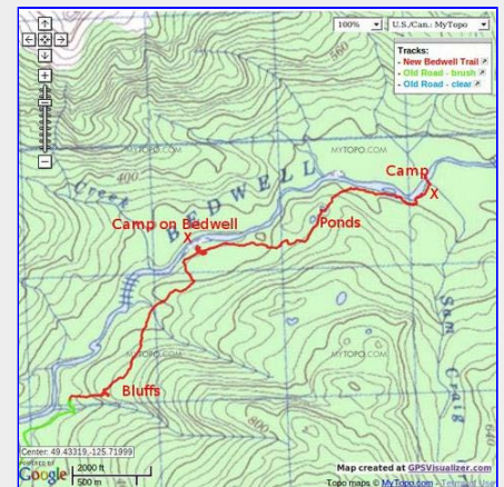
New trail offers good camping and interesting vistas