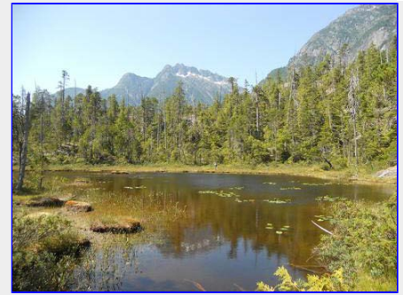
One of several ponds