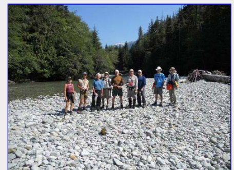
Bedwell River gravel bar