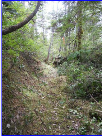
Brushed out trail