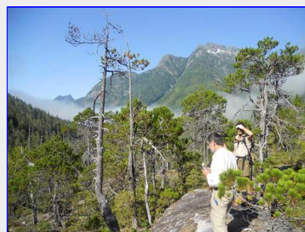
Rocky bluffs offer great views