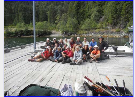
Group on the dock