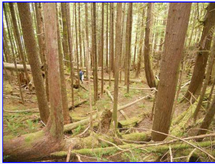
Mature open forest