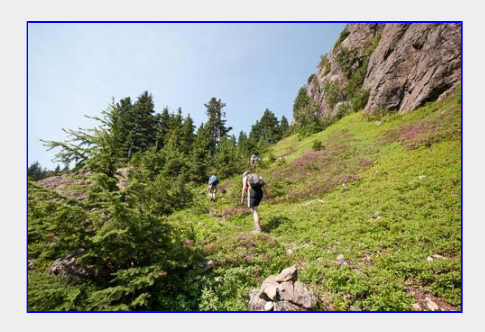
Just below the saddle between The Squarehead and Mount Joan