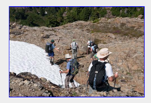
Still some patches of snow