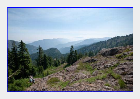
Very smoky in the valleys