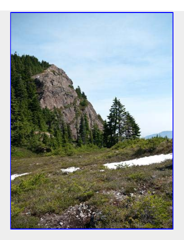
The hanging boulder on the trail up to The Squarehead