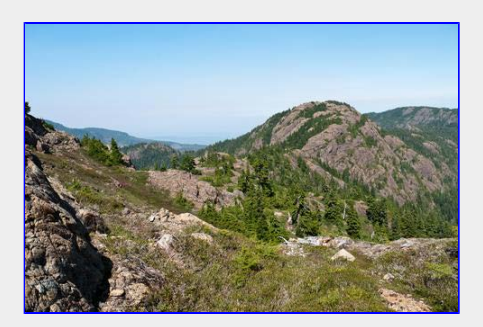
The Squarehead with Mount Curran ridge behind