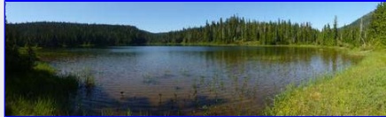
Douglas Lake