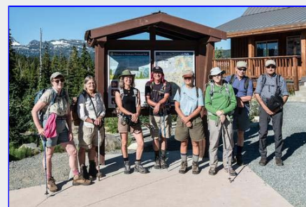
At the start of the hike