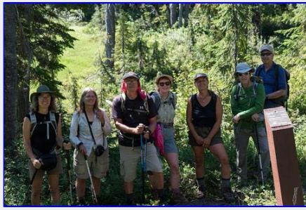
At the junction in Murray Meadows