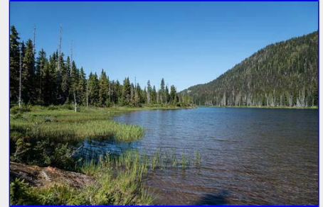
McKenzie Lake