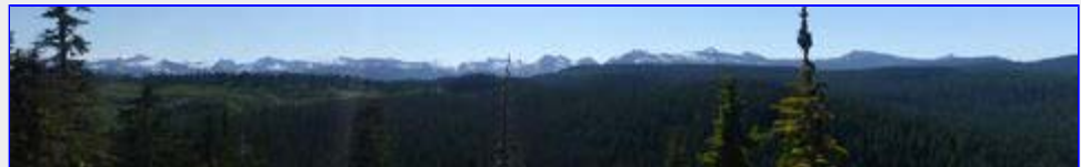
Drabble - Indian Head col viewpoint