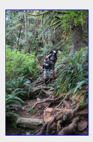
Some more Roots..