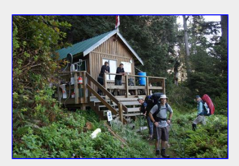
One of the Guardian Cabin