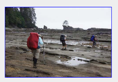
Lets go before the Tide comes back in..