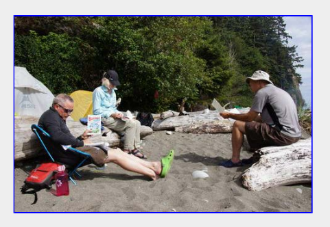
Brainstorming for tomorrows Route...