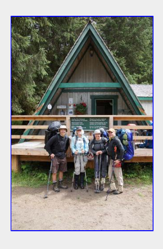
The Start Point at Pachena Bay