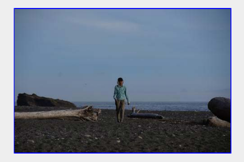
Marg enjoying a little walk on the beach after a long day