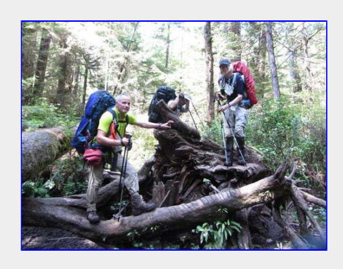
So many Roots, at least there not so slippery...