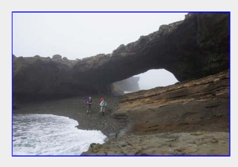
Hey Girls, It's a very very close call from High Tide, come on...