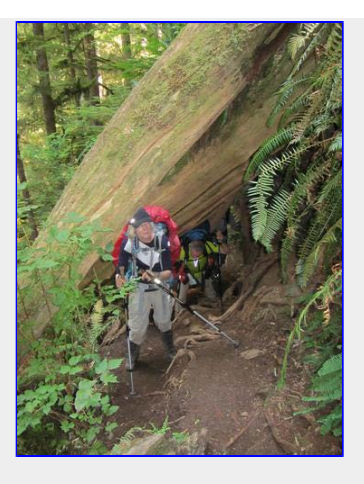
Watch your Heads...