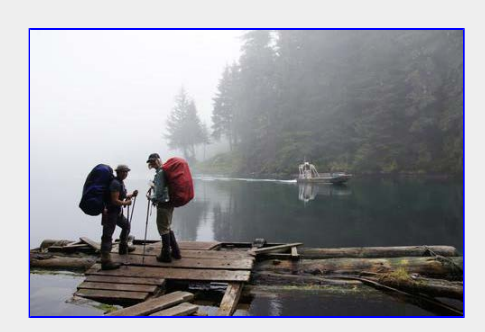
1st Ferry at Nitinat Narrows