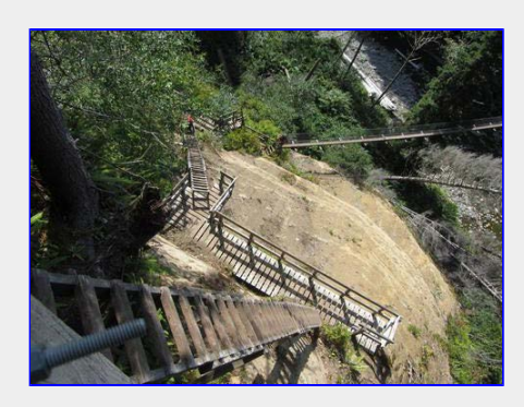
Just love it - Do U Marg!:)