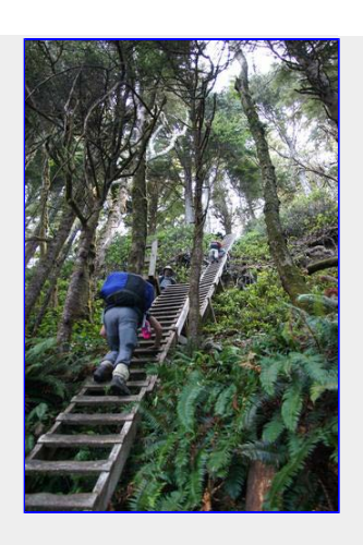
Up Up we go, another Ladder (*&%?%(....