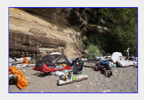
Enjoying Down Time at Tsusiat Falls