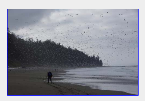
Going through a Flock of Seagulls - Watch out !!!