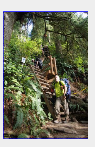
Tsunami Exit Route !!!! :(