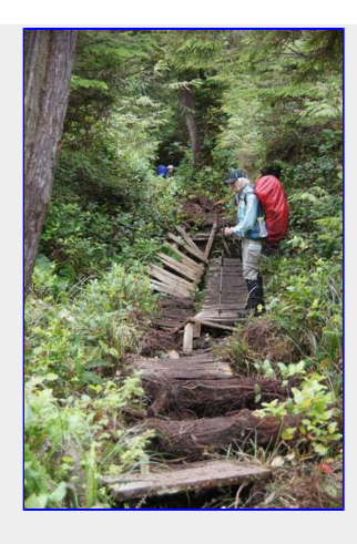
Some of the Boards-Trail conditions....