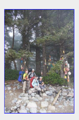
At one of the many Beach access point