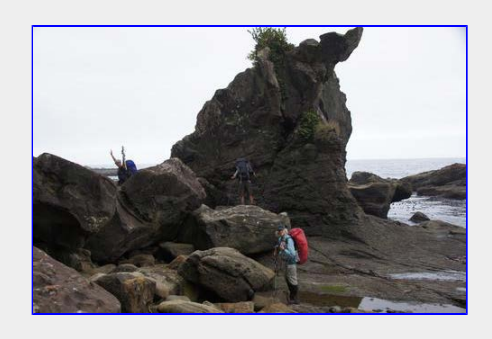
Some more Climbing