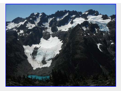
The backside of Mt. Septimus, Hanging Glacier and Green Lake.