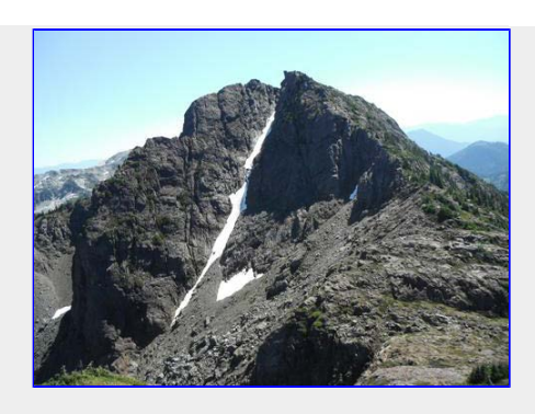
Almost the last peak, along the Flower Ridge Trail.