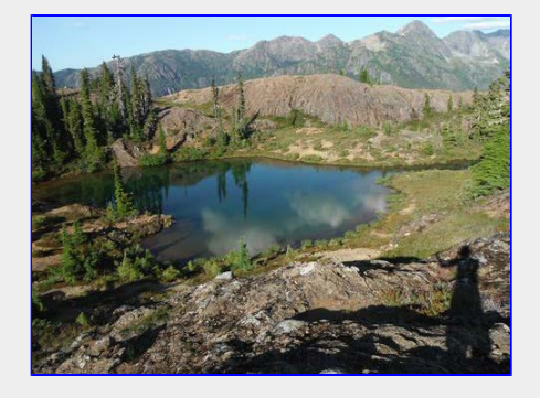
The best tarn up there, at least 10 ft. deep.

Monday: Up at 6:50 am, breakfast, packed up and headed down at 8:50 am. Another cool one at night !! With some breaks going down, we made it back at around 1:30 pm. A quick drive to the Karst Creek boat launch area for a swim!! Then to the Campbell River D.Q. for a cool treat and then home to unpack. All in all it was a great weekend. No one got hurt, just the regular blisters and sore muscles. We didn't see much wildlife up there, no whiskey jacks, bears, cougars, sasquatch, wolf, or deer.