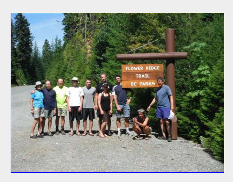
Members from the Island Mtn. Ramblers and CDMC at the trail head.