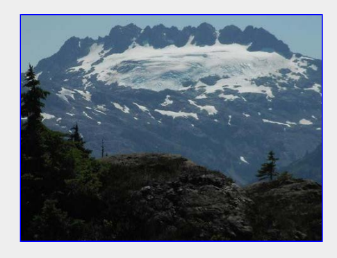
Nine Peaks