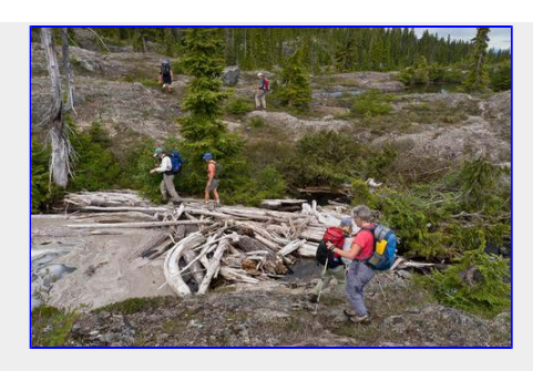
Outfall of the waterfall creek