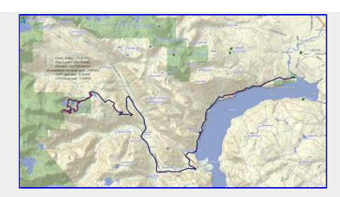
GPS map of the off road drive and the hiking route