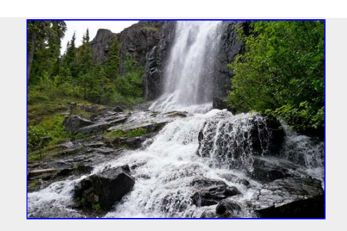
Lots of water compared to my last visit 2 years ago