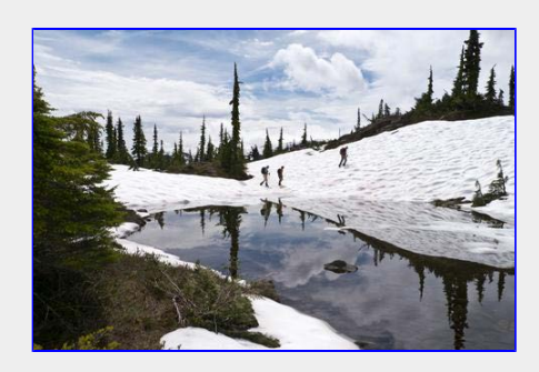
Nice reflections of the hikers