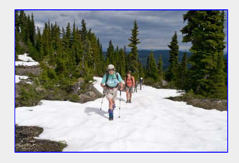
Sunshine brightens up our day