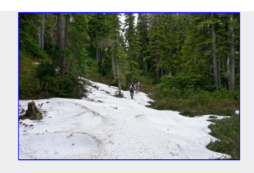
Snow even at the lower part of the trail