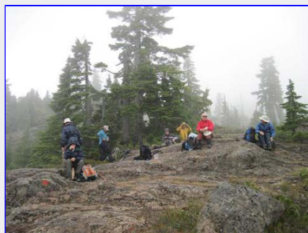
A break to put on rain gear