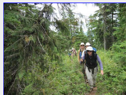
The brush was quite wet as we got higher