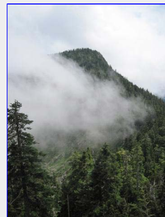
We came up and over this [Linda Hamilton photo]