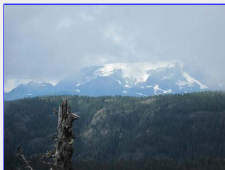
Our last view of the Glacier