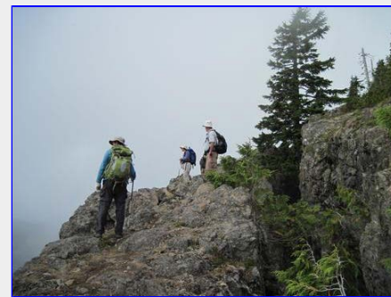
Checking out the exposure along the trail