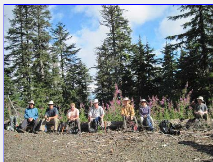
A nice rest break in the sun