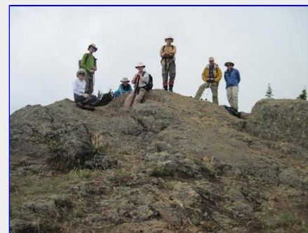
The summit of Mt Becher was dry but the rain started half way down