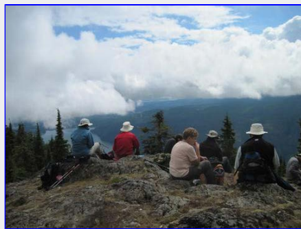
Lunch with limited views as the clouds closed in on us