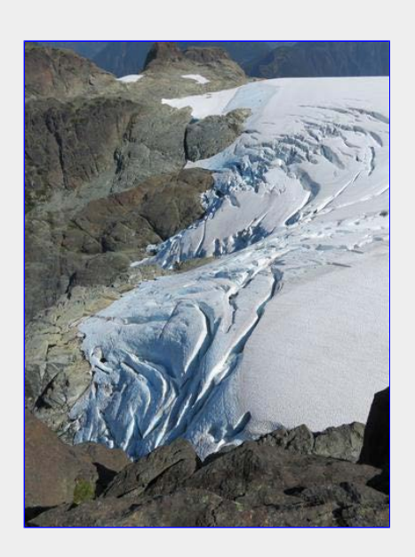
Crevasses on the Comox Glacier