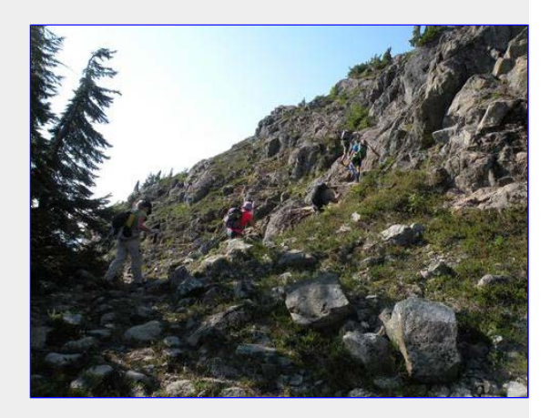
Leaving Lone Tree Pass