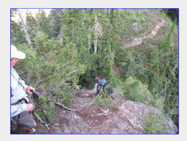
Don't you have to go UP to get to the