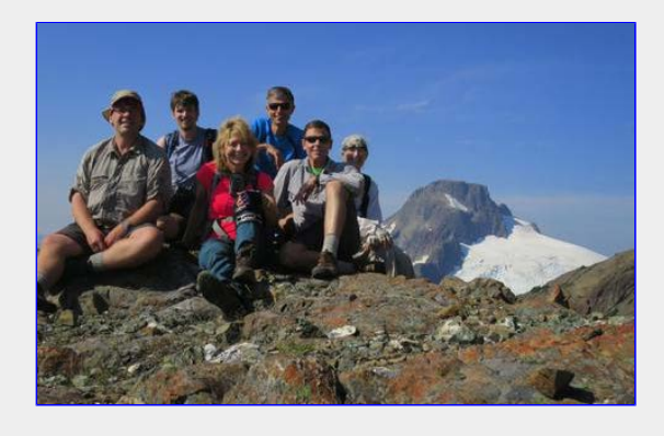
Group shot on the way up with Red Pillar backdrop

https://plus.google.com/u/0/photos/114934745523280834016/albums/6051509519553420529