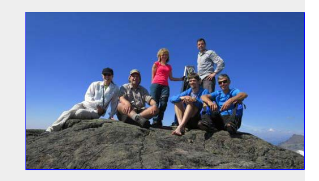
Mandatory group shot on the north summit