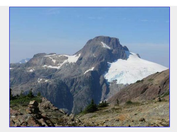
The Red Plllar