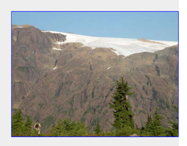
First good view of the Glacier