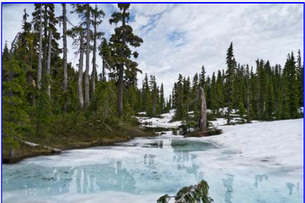
On, or off, trail heading towards Amphitheatre Lake