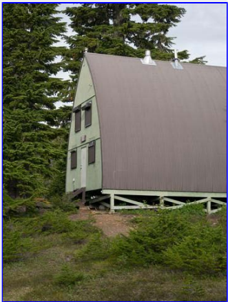
Ranger's Cabin finally free of snow - Damage to the top right window covering was from this winter's heavy snow accumulation.