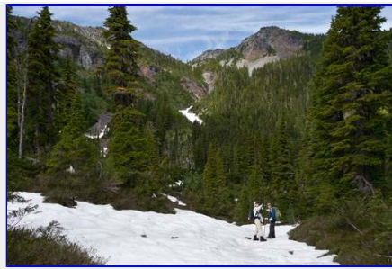
Quite a lot of snow on the trail to the lake