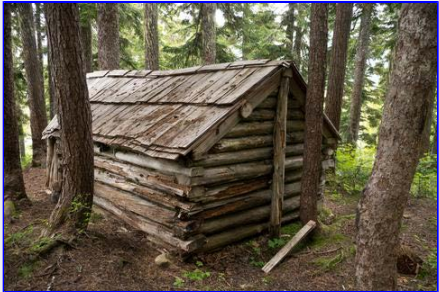
Sid William's Cabin survived the winter