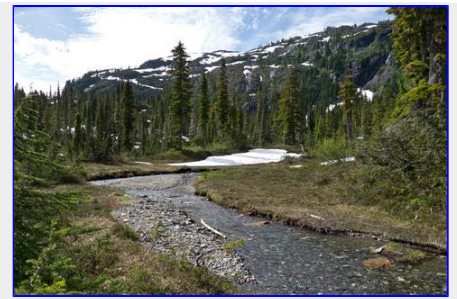
Fish bearing stream running into the lake