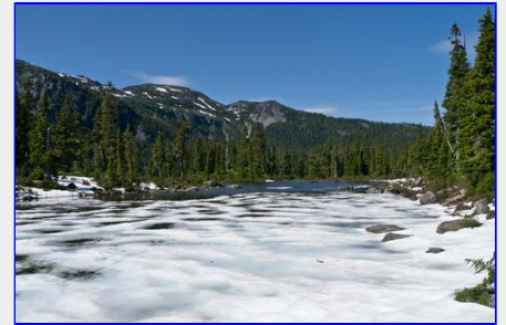
Small Lake before dropping down to Circlet Lake