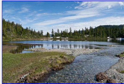
Looking across Amphitheatre Lake back towards Mount Washington - Strata Mountain on the right