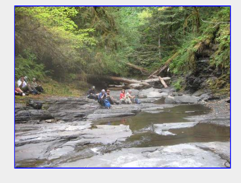
snack time