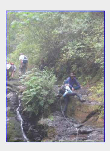
one BIG step