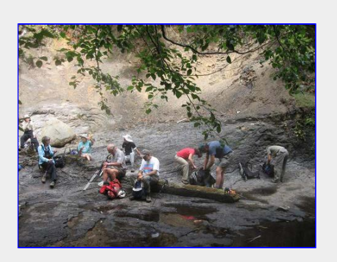
lunch at last!