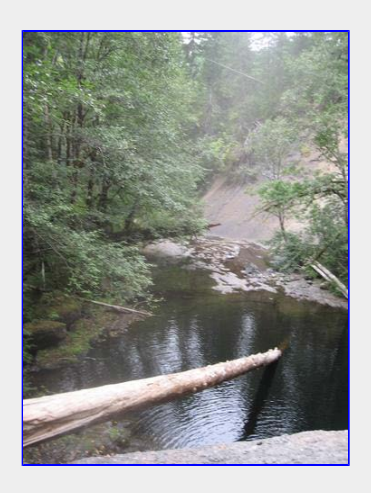
view from above