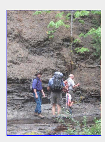
a short step across