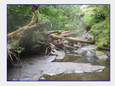
typical log jam

Some of the group saw several American Dippers including one which flew over us at the lunch stop. Also several red-legged frogs were observed. Frank H