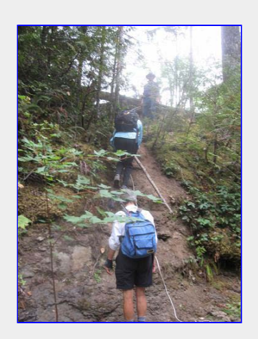
the last climb