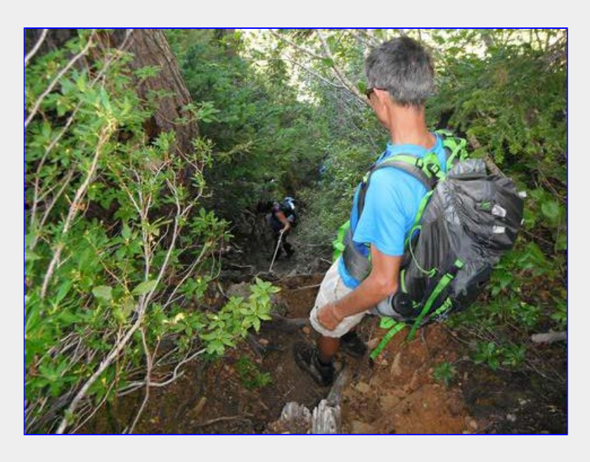
Ropes Utilized along Ridge to Glacier