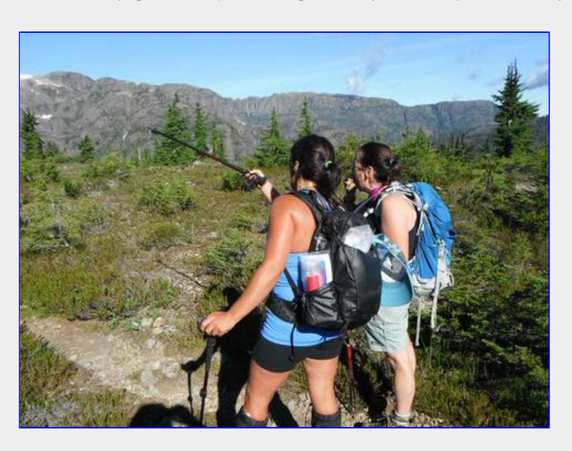
Trip Captain displaying Excellent Leadership

By 8:15 pm we returned to the cars. We all returned to Harmston by 930 pm. Overall our one day glacier trip was A great day. Thank you to everyone who participated.