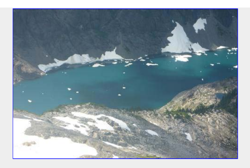
Observing icebergs in late August