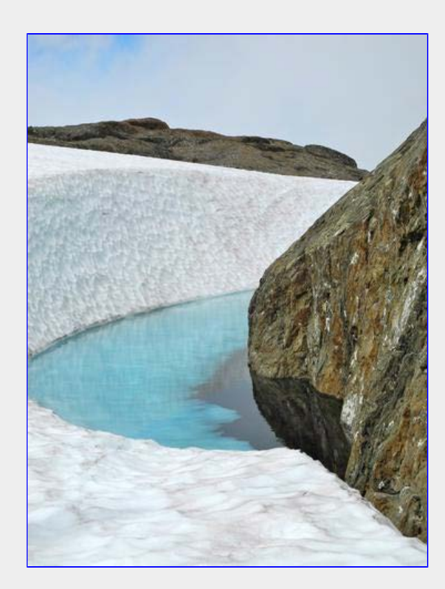
Beautiful little pool of water on the glacier. Care for a dip?