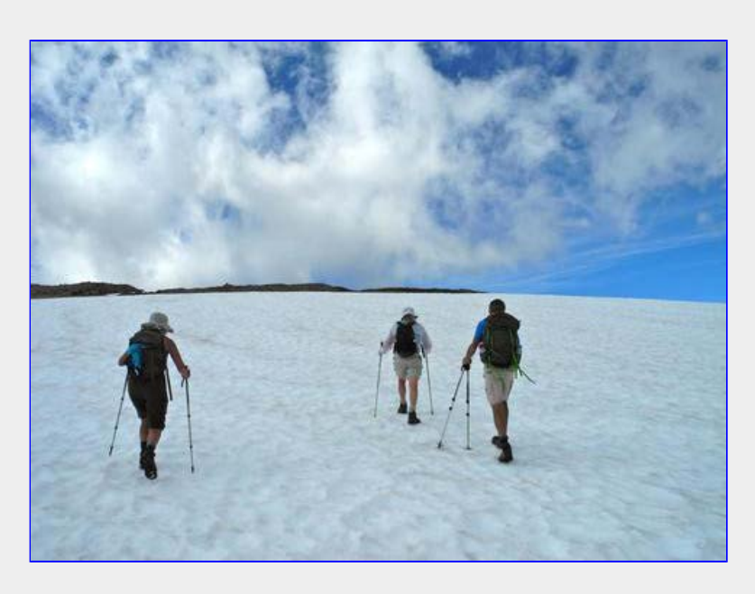
Making their way to the north summit