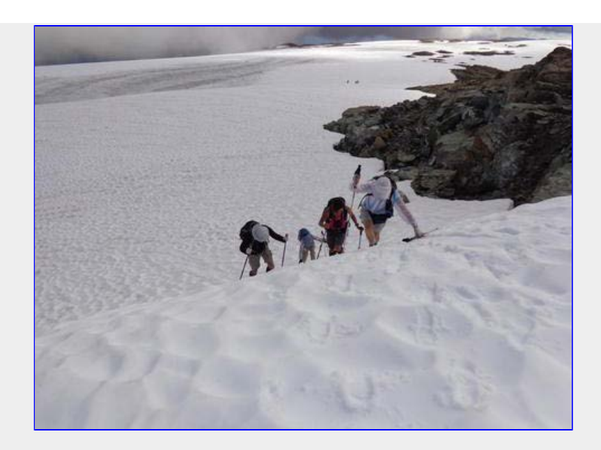
Almost at the top