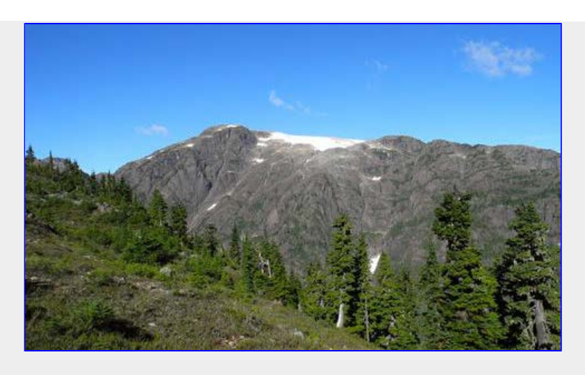
It looks so far away and daunting!! Magnificent hike!